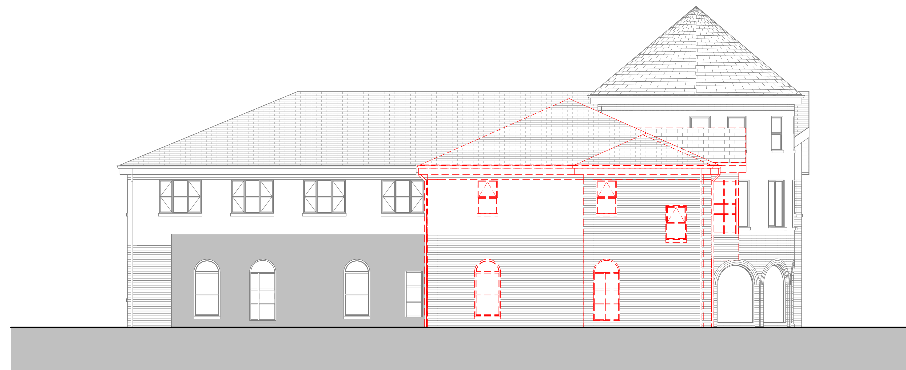
2 Elevation 3 Demolition 1 : 100