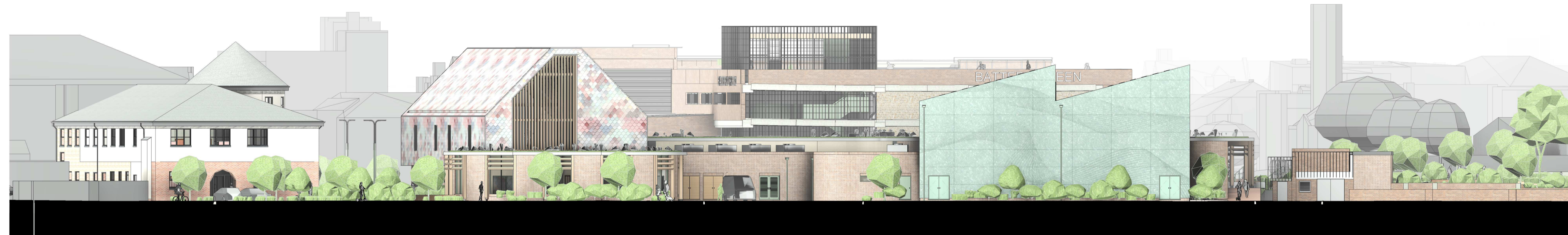
3 C_New Build - South East 1: 200