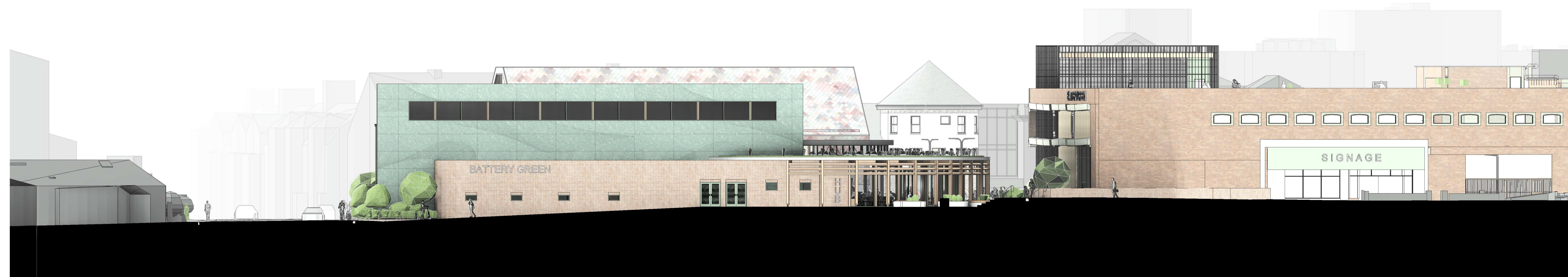
4 C_New Build - North East 1: 200