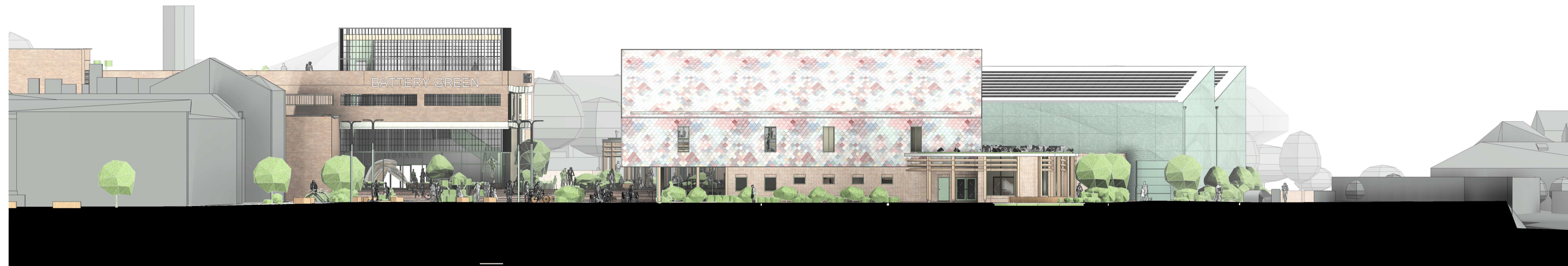
2 C_New Build - South West 1: 200