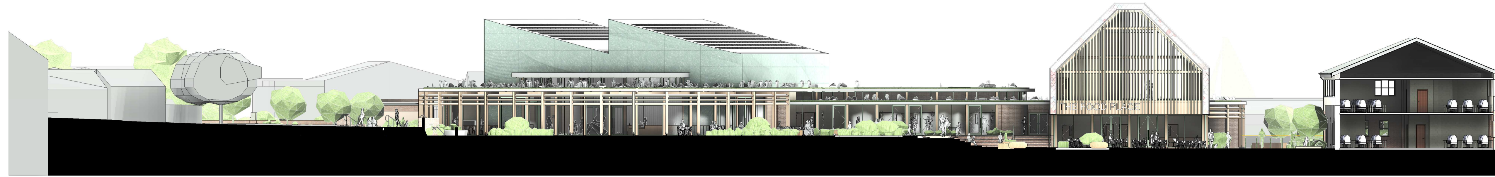
1 C_New Build - North West 1: 200