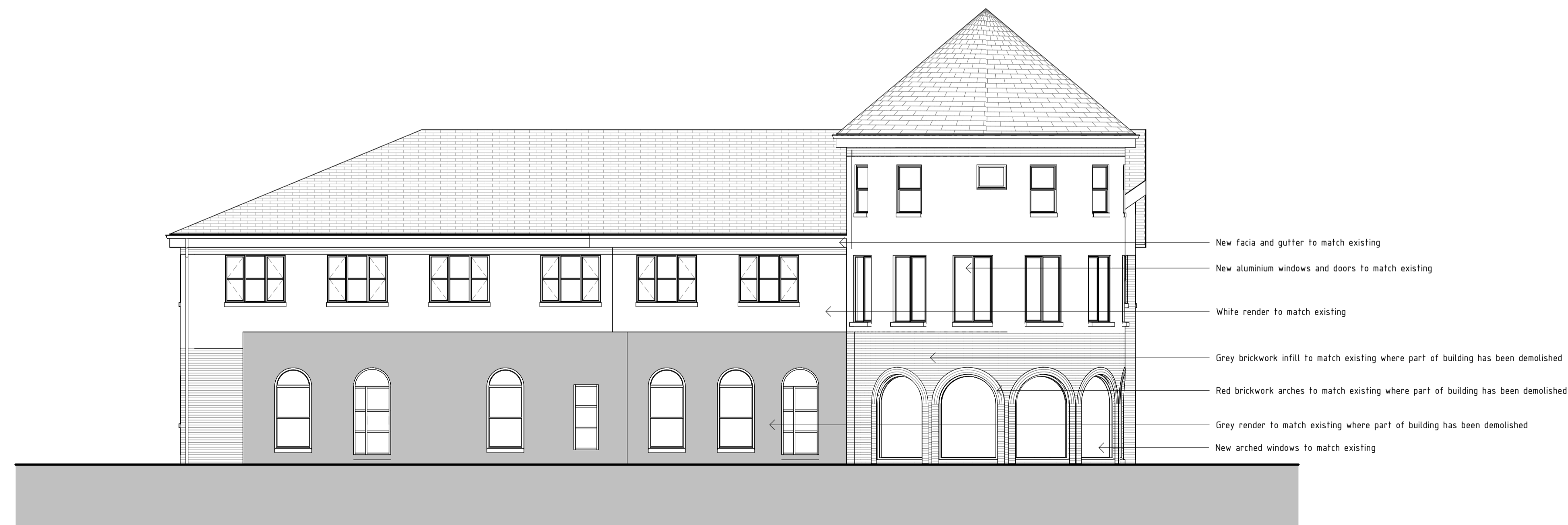
2 Elevation 3 Proposed 1 : 100