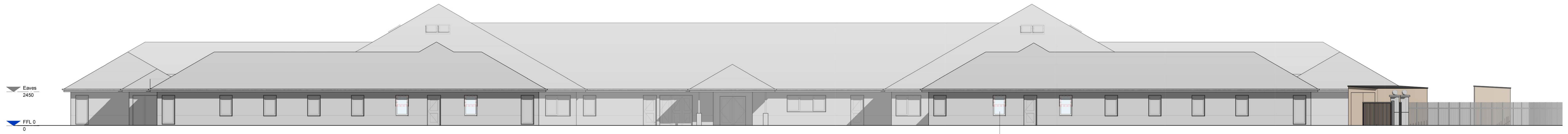
Proposed North Elevation 1:100