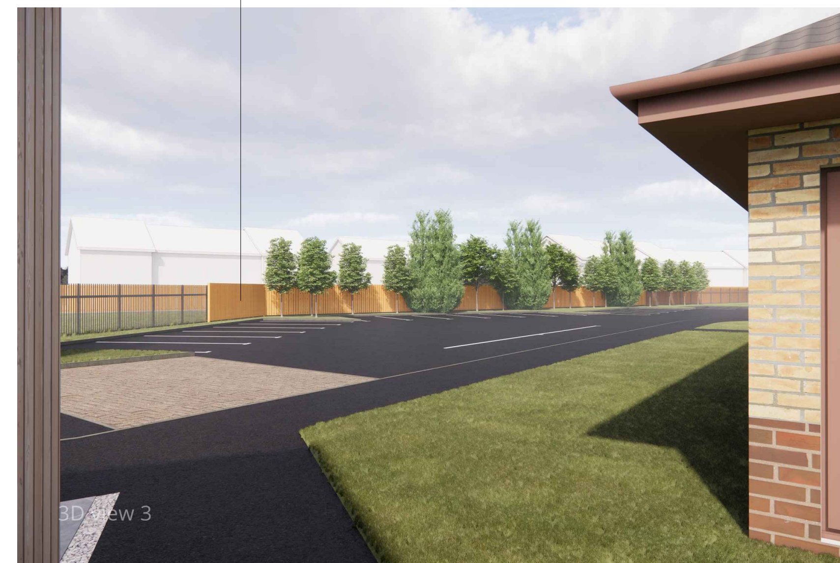
3D view 3