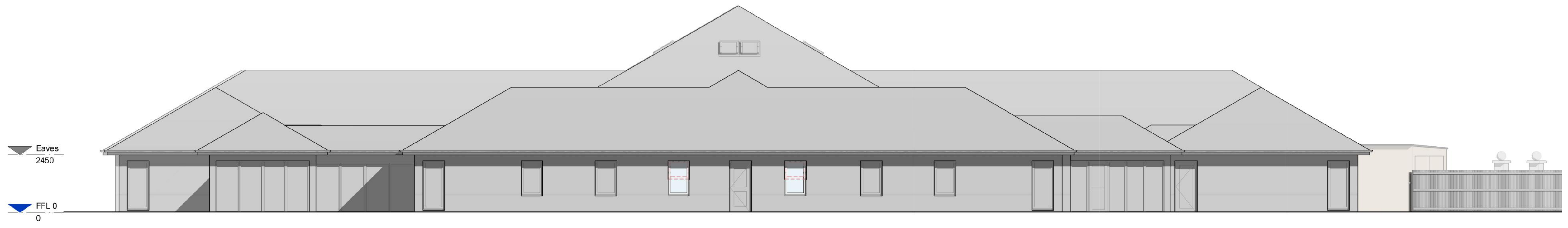
Proposed East Elevation 1:100