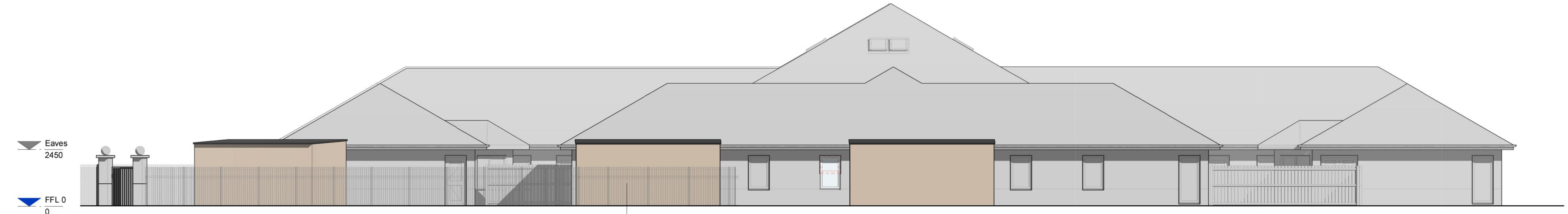
Proposed West Elevation 1:100