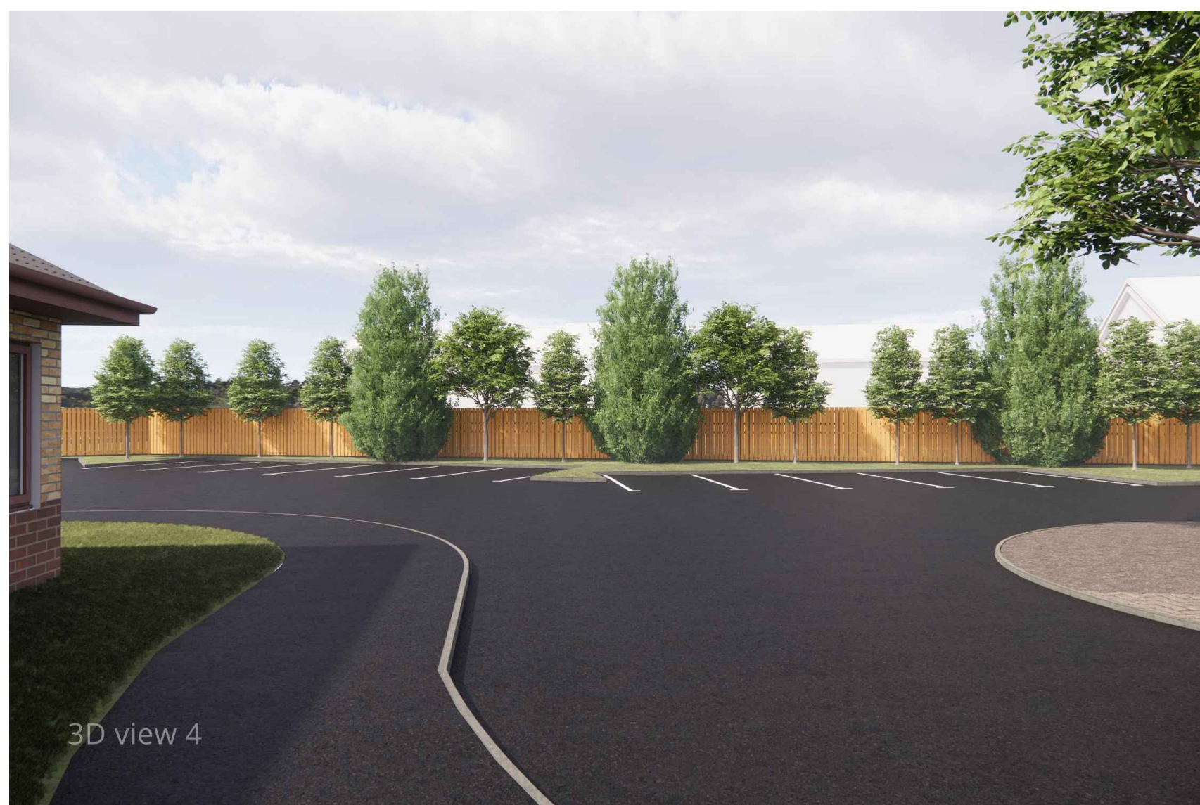
3D view 4