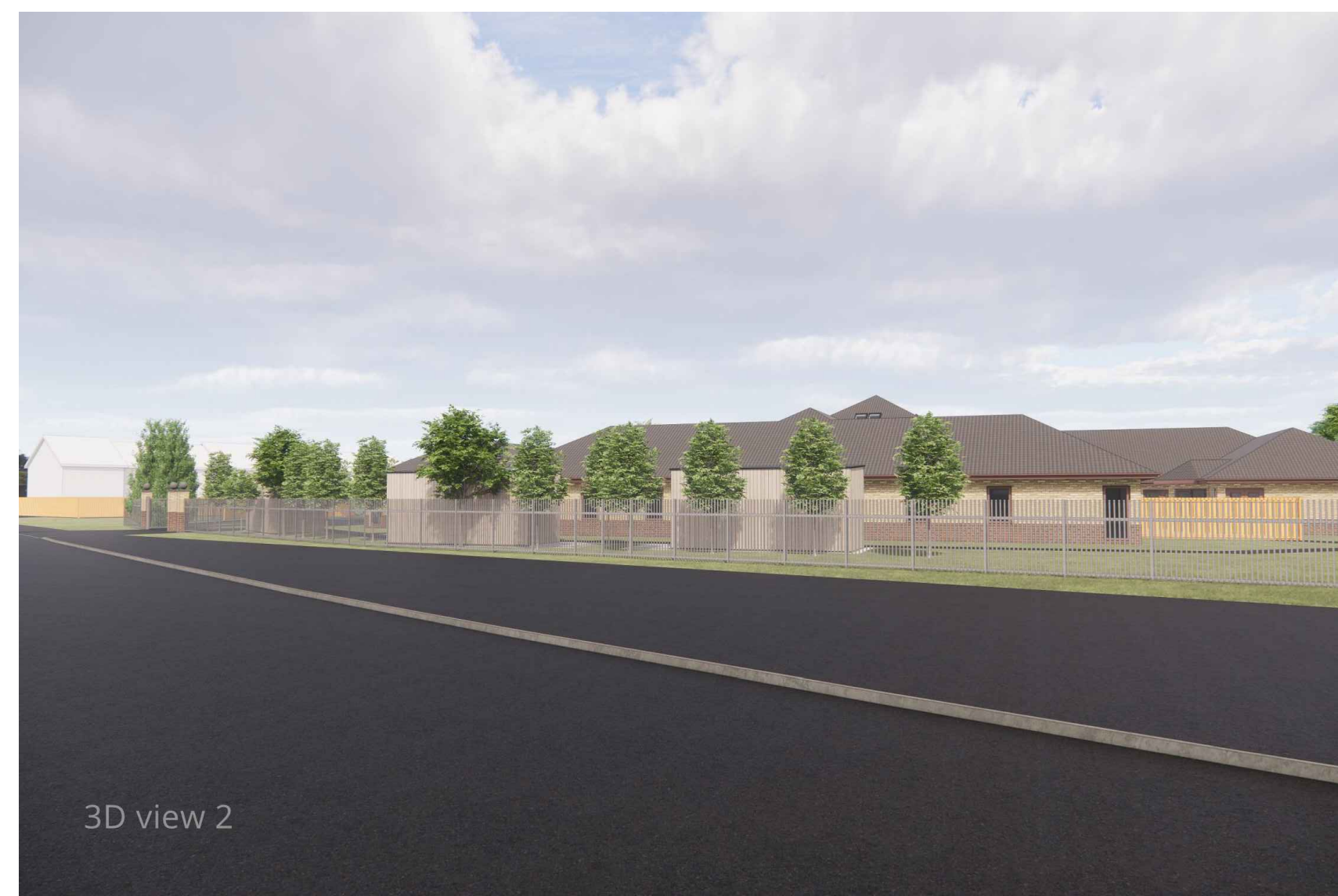
3D view 2