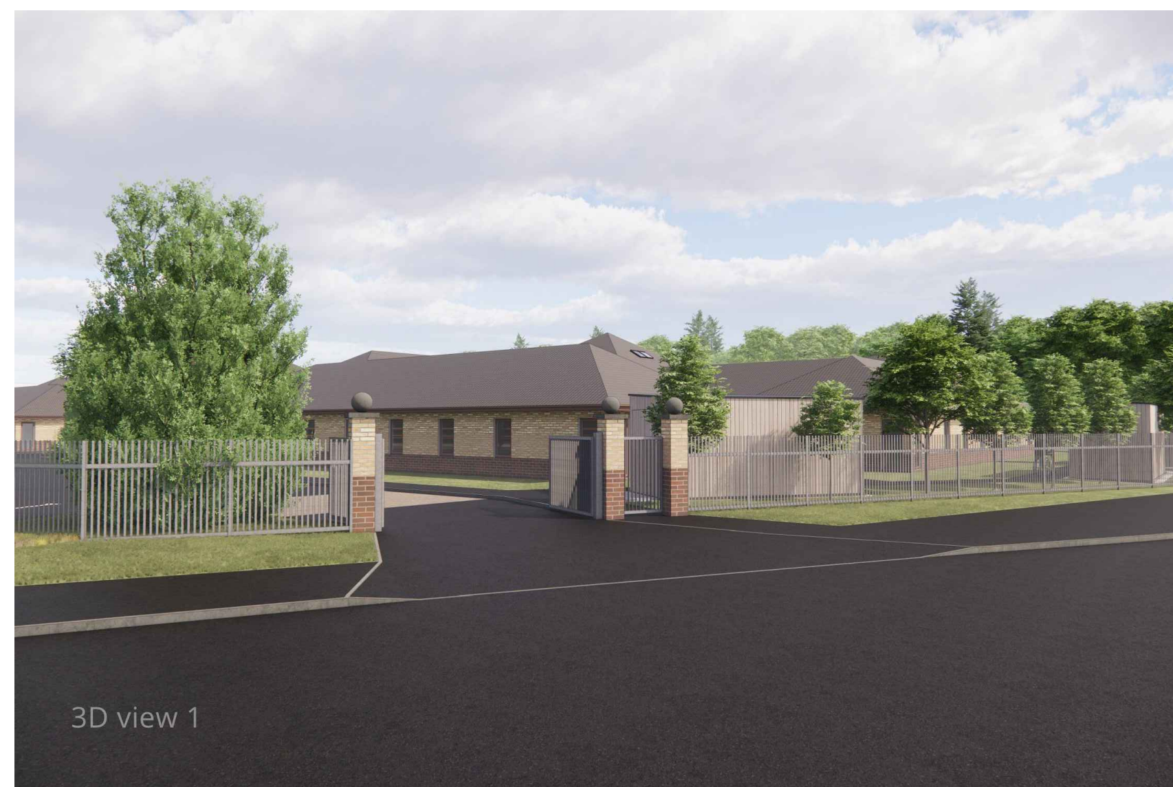
3D view 1