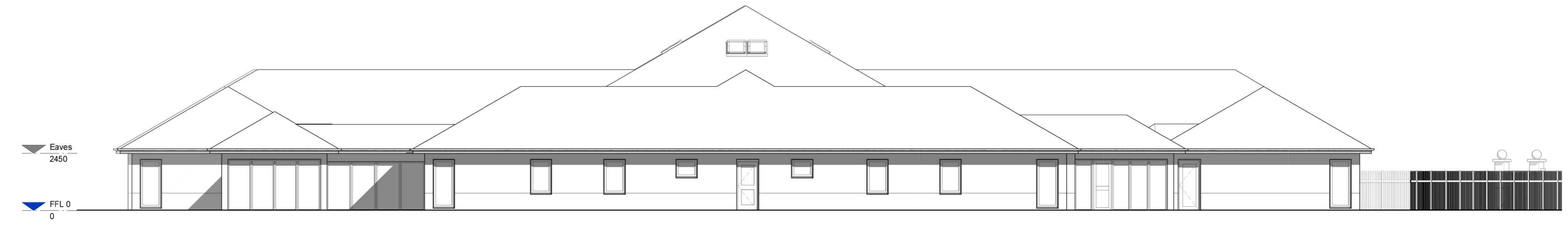
Existing East Elevation 1:100