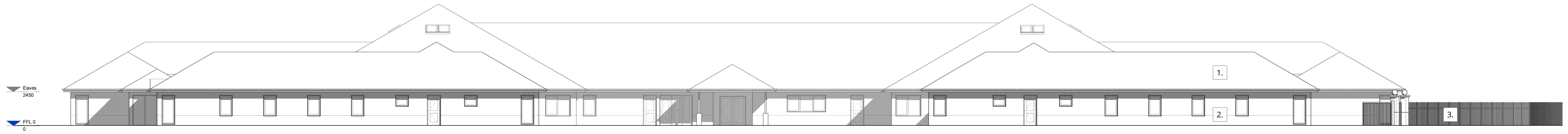
Existing North Elevation 1:100

Rainwater goods: uPVC, brown Eaves & soffits: uPVC, brown Doors & windows: uPVC, brown Clits: facing brick soldier course