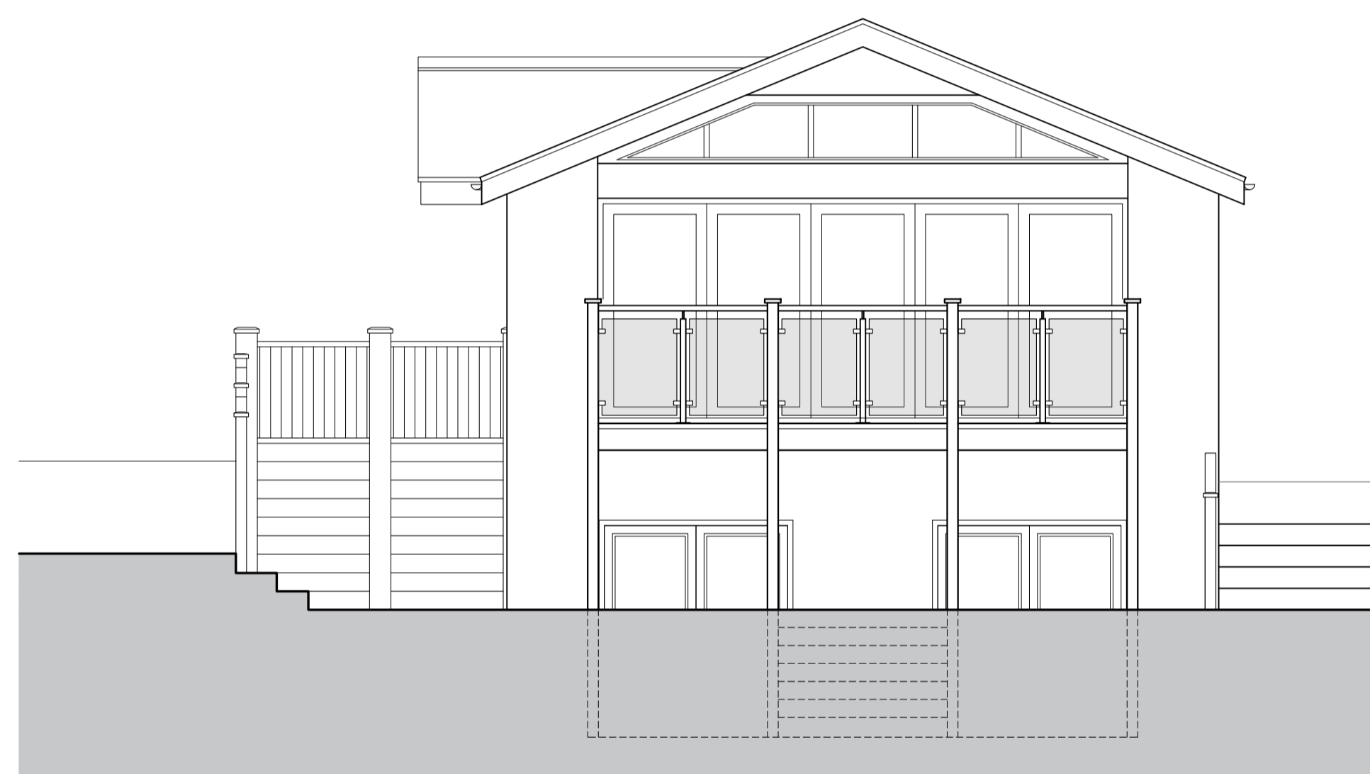
North East Elevation Scale: 1:50 @ A1