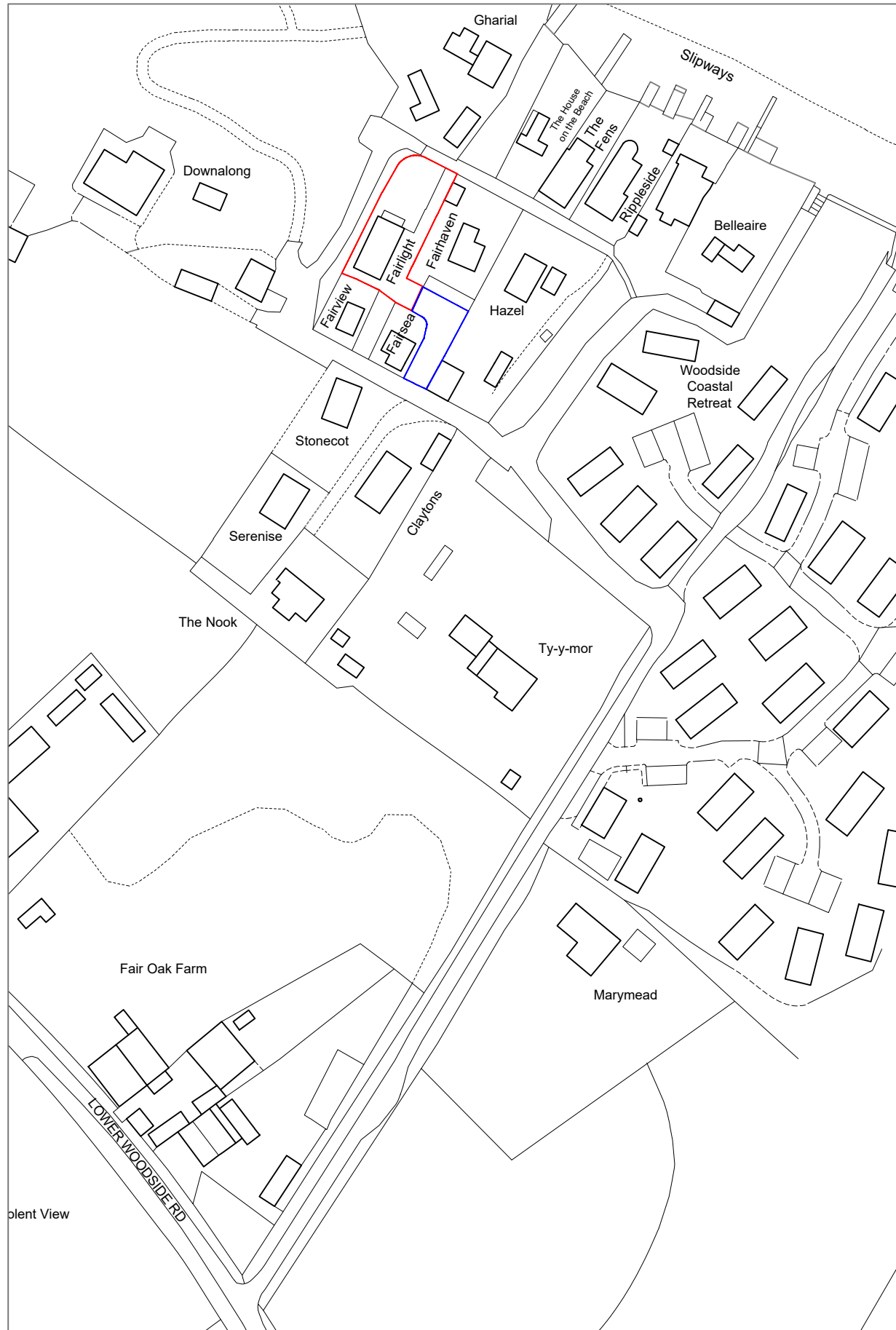
Location Plan Scale = 1:1250 @ A3