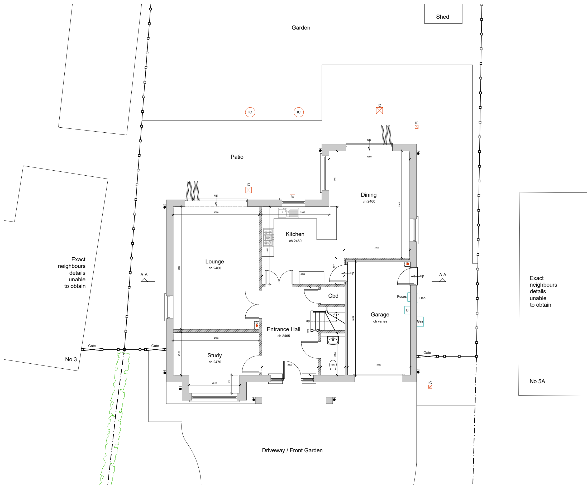
Existing Ground Floor Plan Scale - 1:100@A3