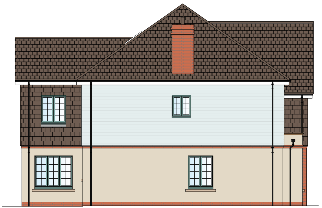
Existing Side Elevation Scale - 1:100@A3