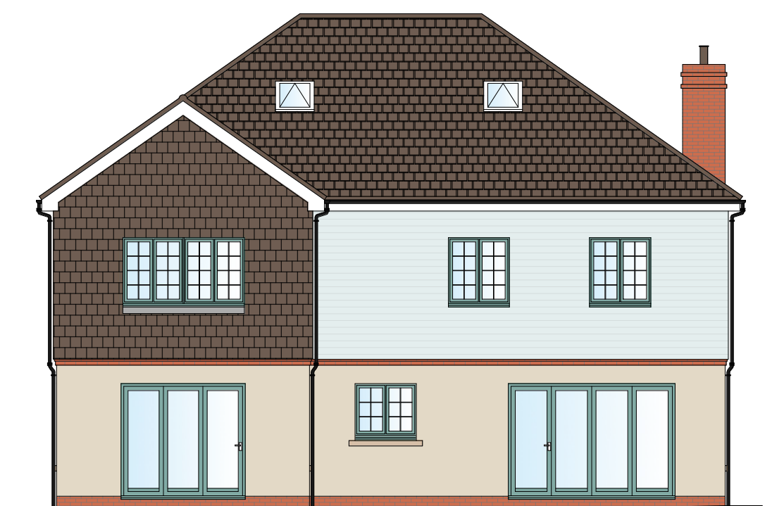
Existing Rear Elevation Scale - 1:100@A3