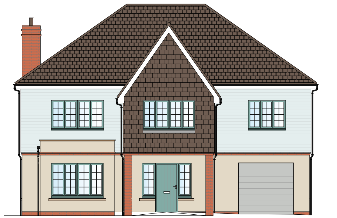
Existing Front Elevation Scale - 1:100@A3

COPYRIGHT © DETAILS OF THIS DRAWING ARE THE COPYRIGHT OF ASPIRE ARCHITECTURAL SERVICES LTD AND MUST NOT BE REPRODUCED OR COPIED WITHOUT PRIOR WRITTEN CONSENT. ANY ERRORS OR OMISSIONS ARE TO BE REPORTED TO THE ARCHITECT IMMEDIATELY. ALL PROPOSED ROAD AND JUNCTION ALTERATIONS SUBJECT TO HIGHWAYS ENGINEERS DETAILED DESIGN. REMOVAL OF ANY EXISTING TREE AND LANDSCAPED AREAS SUBJECT TO NEGOTIATIONS WITH LOCAL AUTHORITY PLANNING DEPT AND OTHER STATUTORY CONTROLS. ALL DRAWINGS TO BE READ IN CONJUNCTION WITH STRUCTURAL ENGINEERS DRAWINGS AND ALL RELATED ARCHITECTS AND CONSULTANT DRAWINGS AND OTHER RELEVANT INFORMATION. ANY CHANGES TO THE DRAWN DESIGN DURING CONSTRUCTION WORK SHOULD BE RECORDED AND REPORTED TO THE DESIGNER IMMEDIATELY. ASPIRE ARCHITECTURAL SERVICES LTD WILL NOT TAKE RESPONSIBILITY FOR ANY VARIATION MADE BY OTHERS TO THE DESIGN AND CONSTRUCTION DETAIL CONTAINED WITHIN THIS DRAWING.