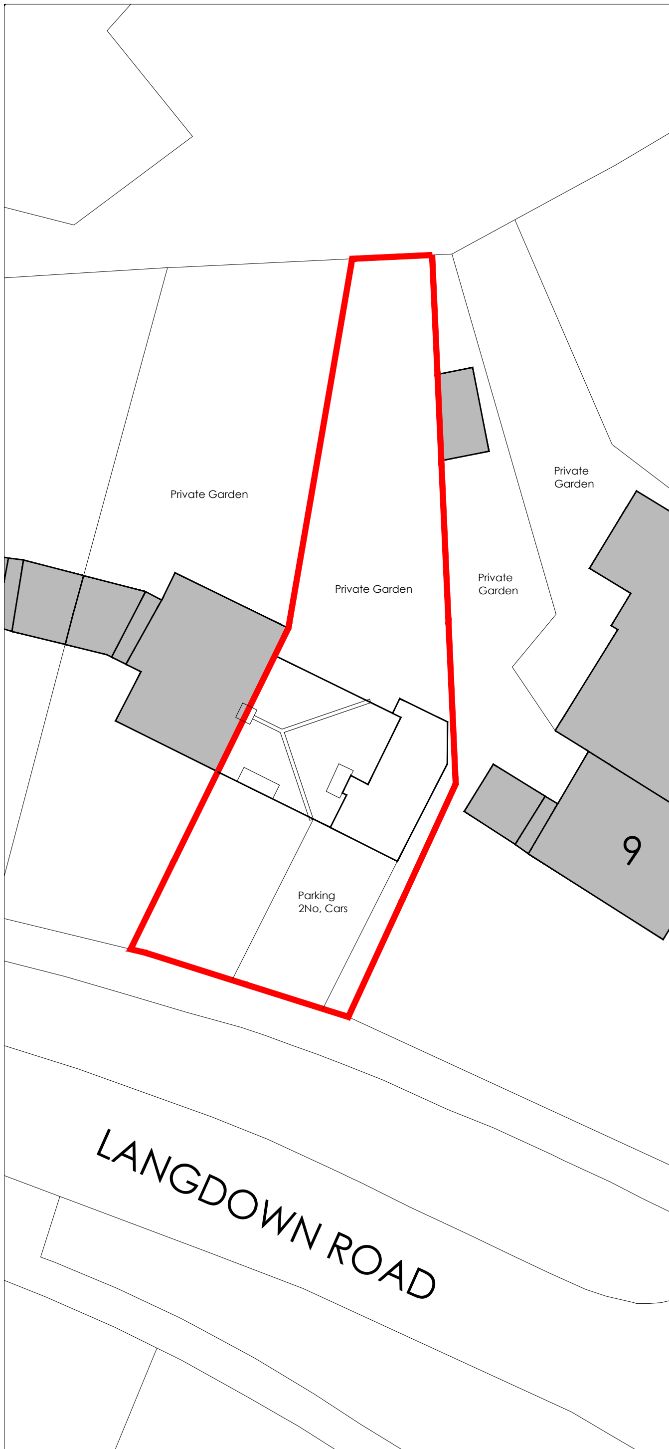
PROPOSED SITE PLAN / BLOCK PLAN