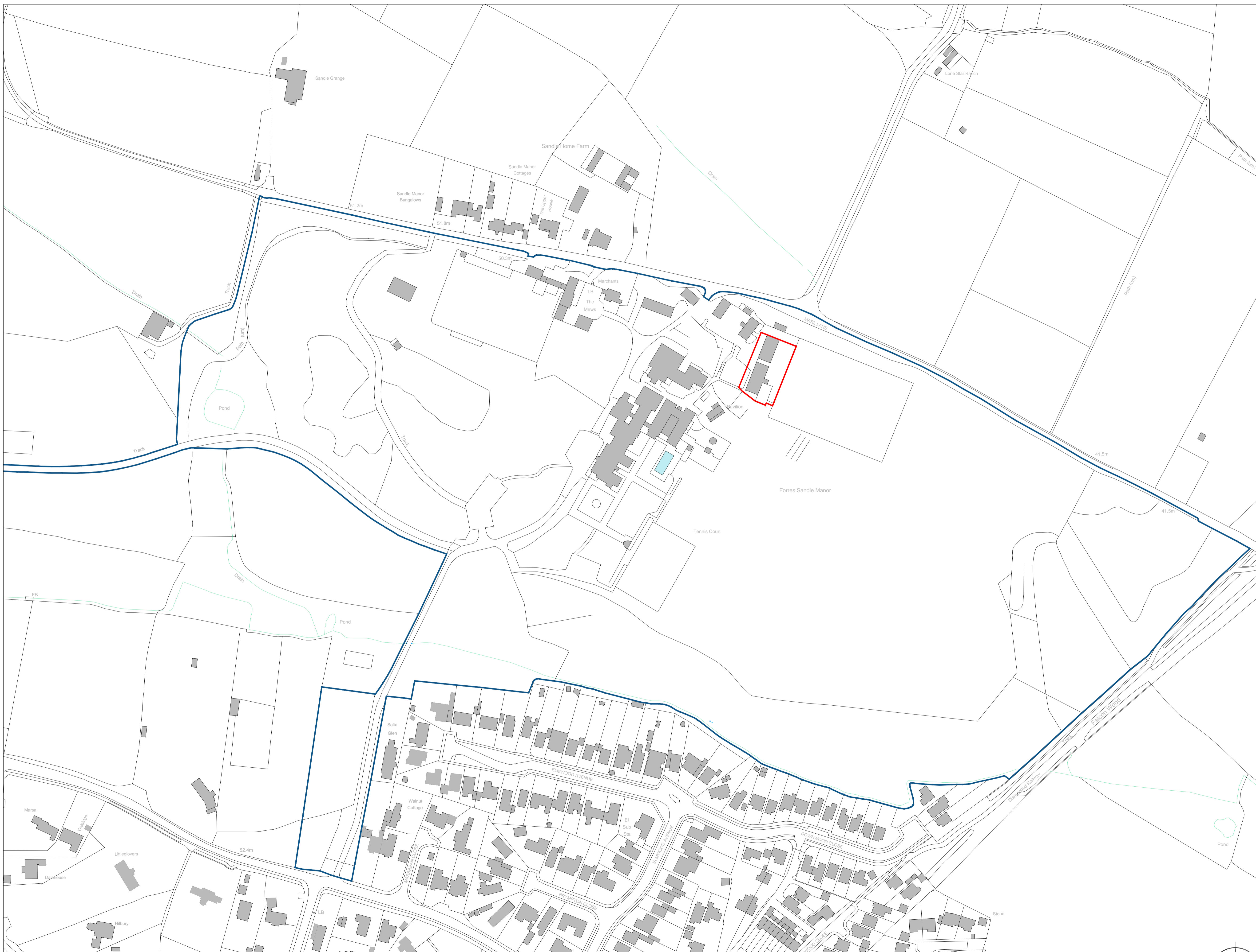
site location plan [A1 1:1250]

notes this drawing is the copyright of the pdp architecture llp and must not be reproduced in whole or part or used for the execution of works without their permission. all dimensions to be checked on site prior to commencement of construction works and the architect notified of any discrepancy. figured dimensions are to be used in preference to scaled dimensions. no deviation from this drawing will be permitted without prior consent of the architect. all drawings are prepared subject to a full measured and structural survey of the buildings and site. all structural work is subject to the appointment of a structural engineer to confirm and agree the structural proposals. os promap licence no. 100020449.