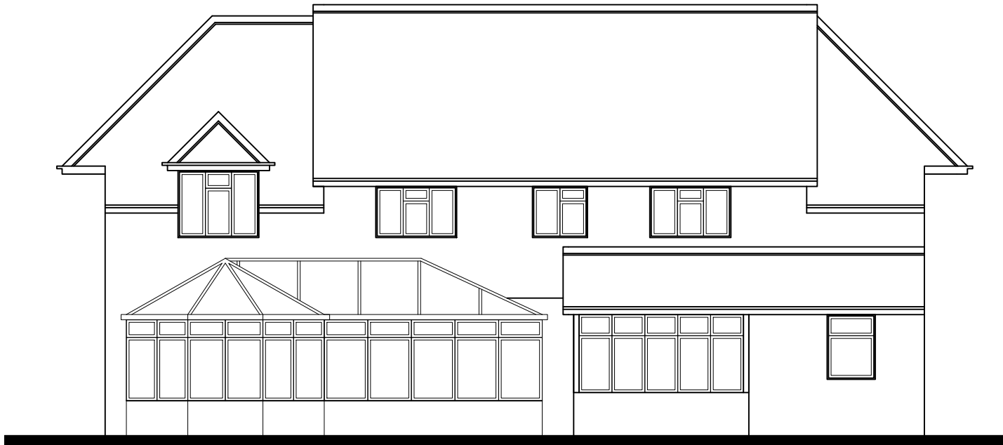
EXISTING REAR (SOUTH WEST) ELEVATION SCALE 1:100@A3