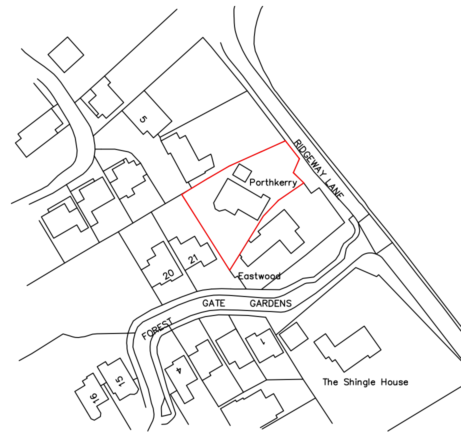
EXISTING LOCATION PLAN SCALE 1:1250@A3