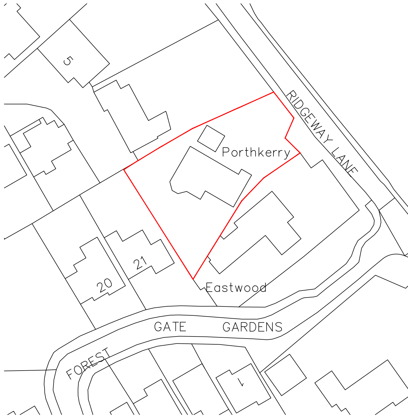
EXISTING BLOCK PLAN SCALE 1:500@A3