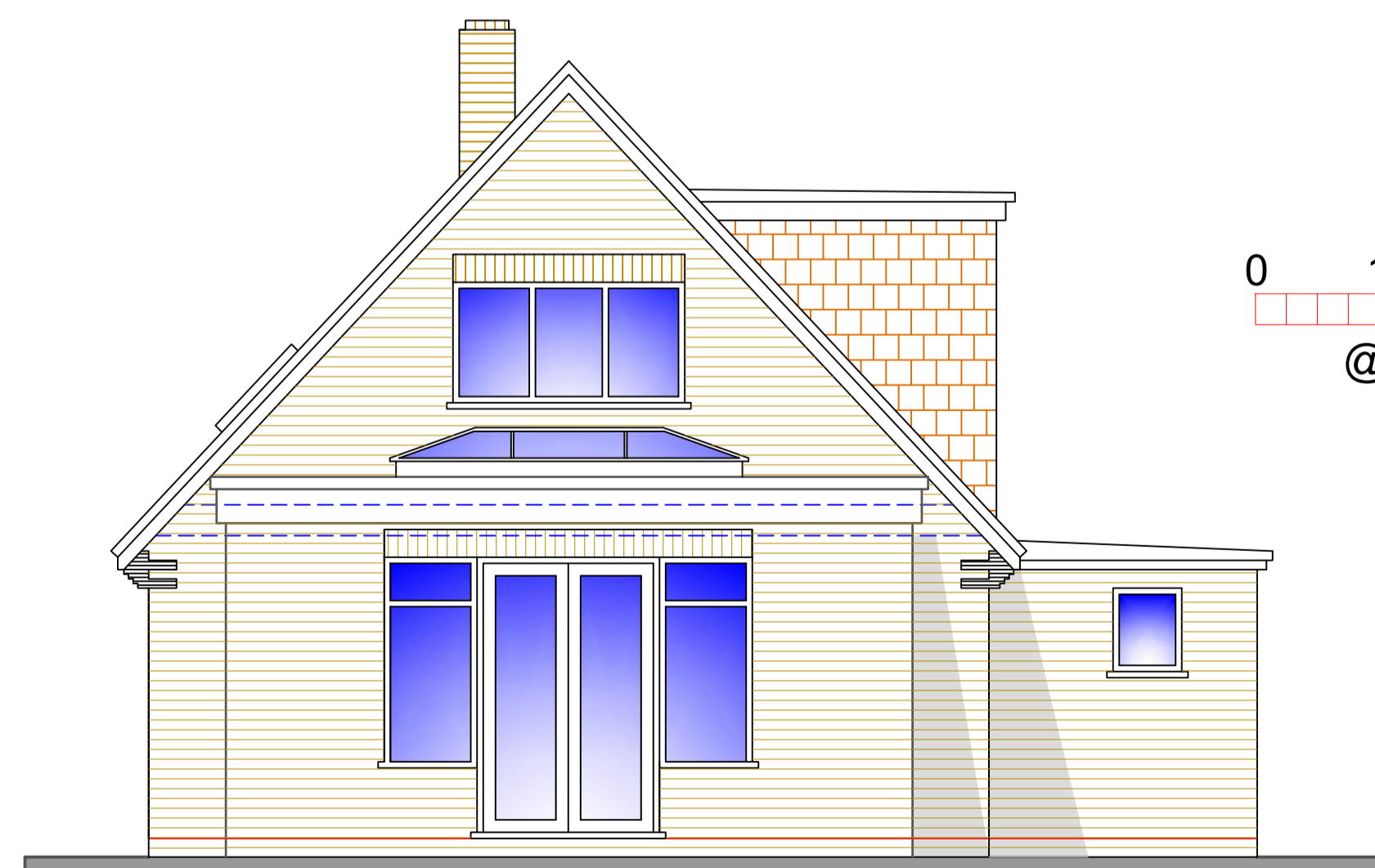
EXISTING REAR ELEVATION (NORTH)