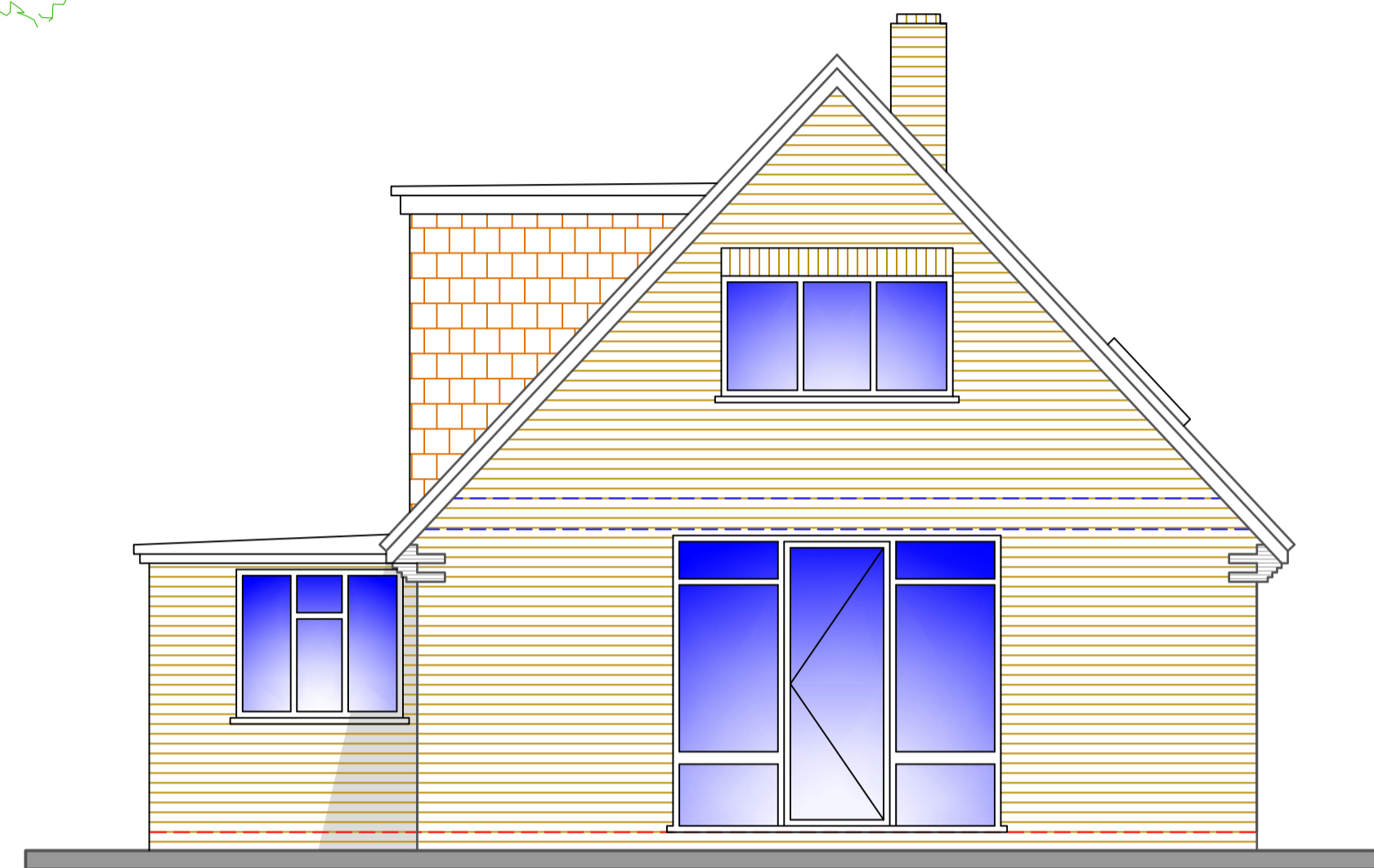
EXISTING FRONT ELEVATION (SOUTH)