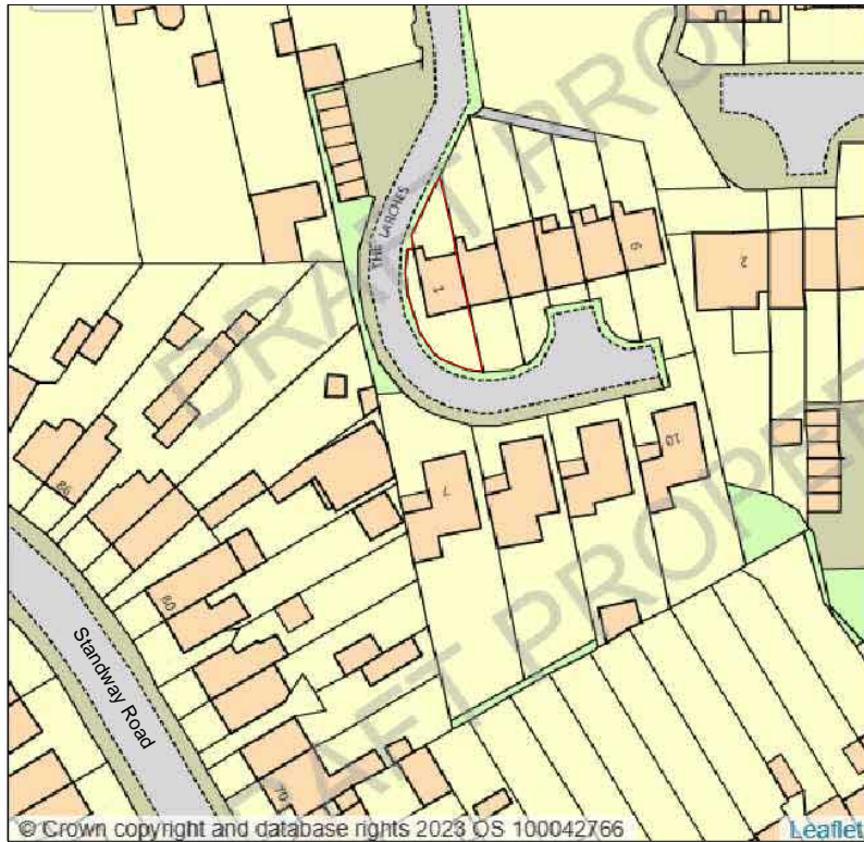
LOCATION PLAN SCALE 1:1250 2030 OS 100042766

TITLE: Single storey front extension with new entrance