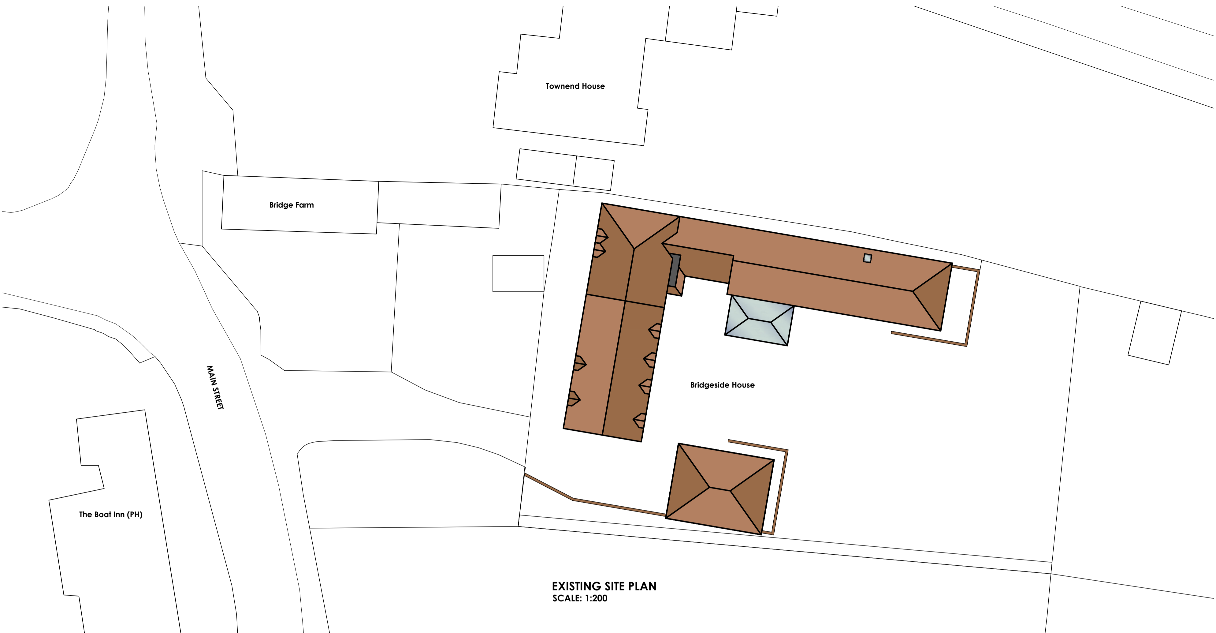
EXISTING SITE PLAN SCALE: 1:200