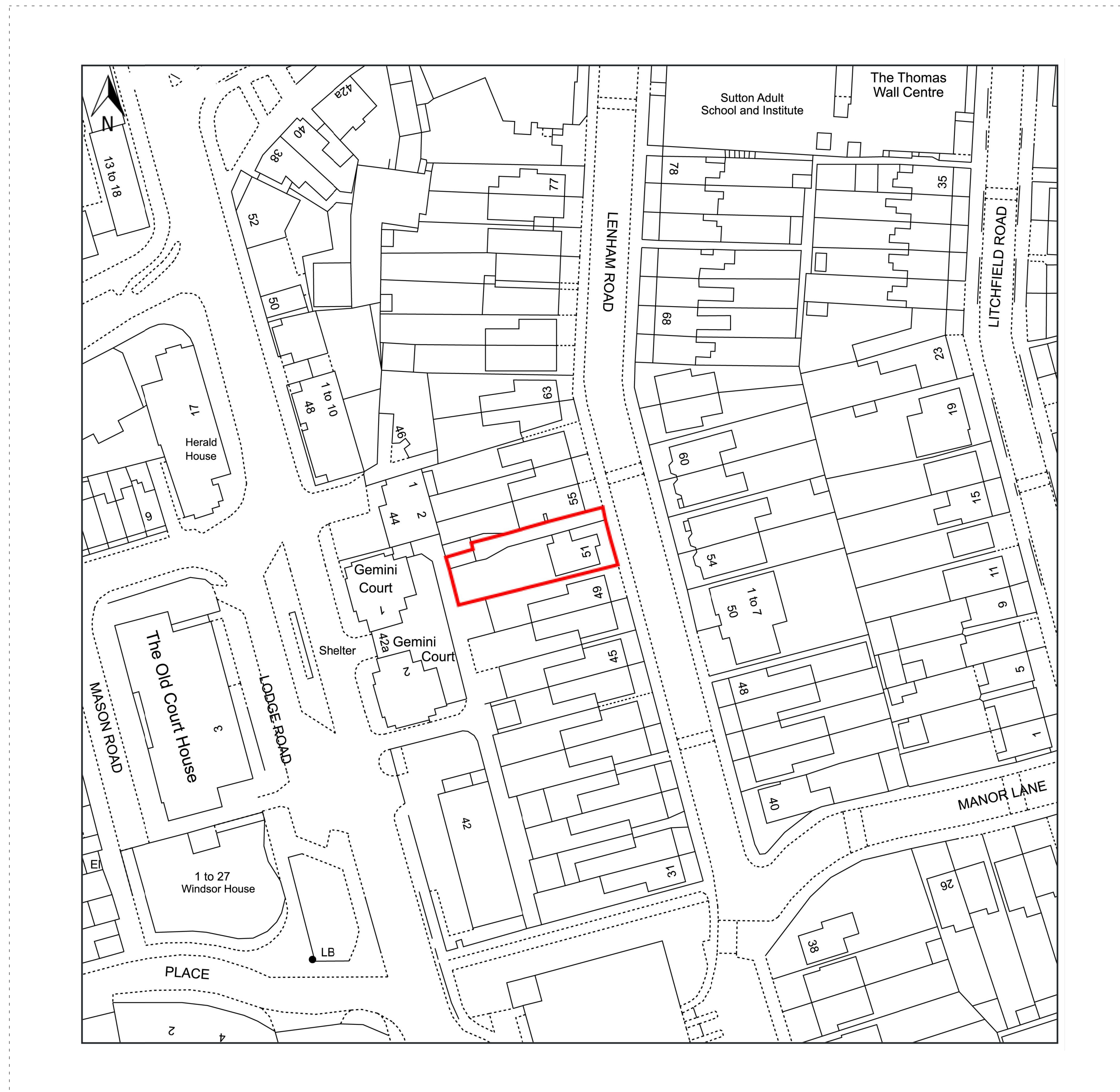
LOCATION PLAN 1:1250@A3

Notes Do not scale from drawing unless for planning purposes. All dimensions to be checked on site. All levels to be checked on site. All setting out must be checked on site. This drawing is copyright WhitemanDesign. This drawing must not be used onsite unless 'Issued for Construction'.