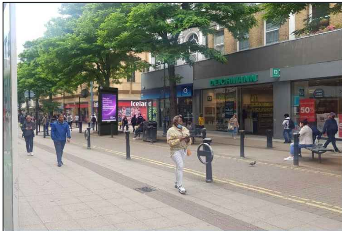
PROPOSED PHOTOMONTAGE NTS