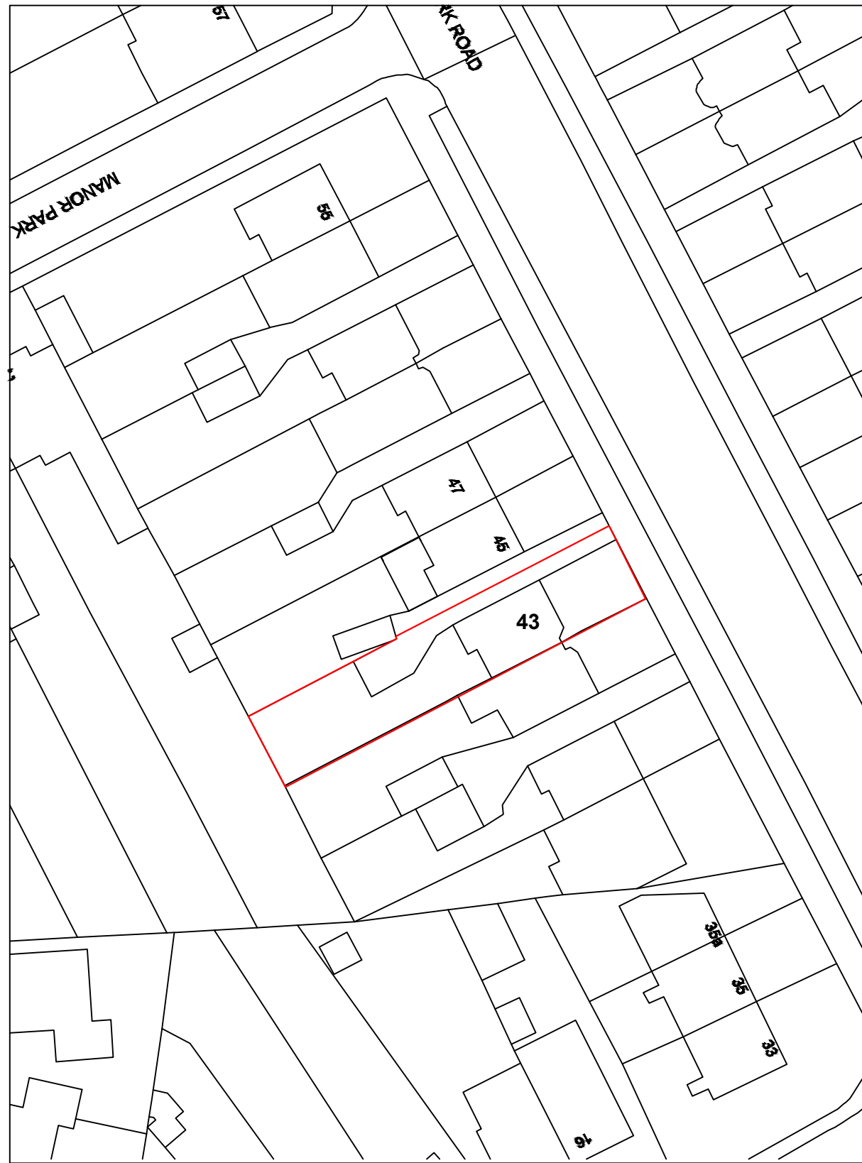
Existing Site Plan Scale: 1/500