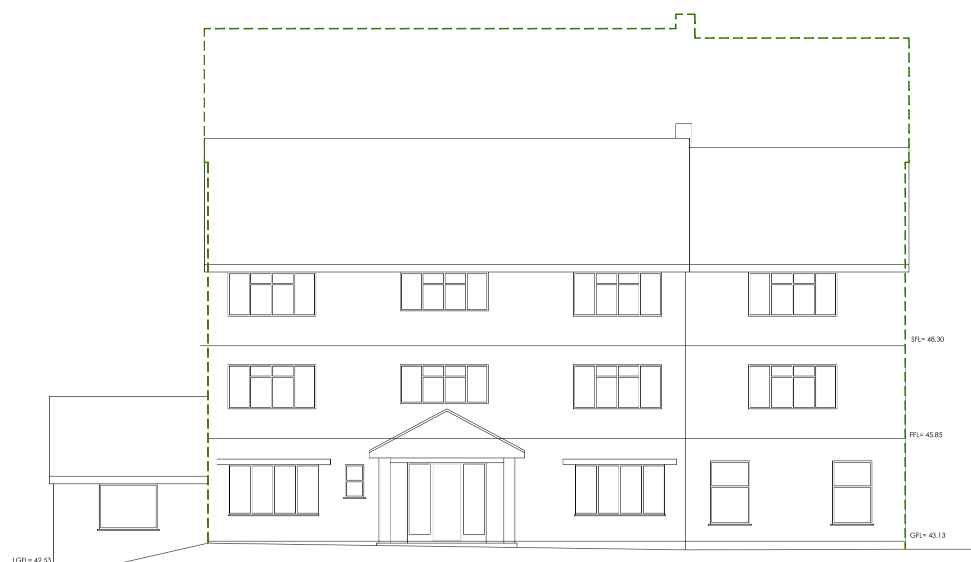
Front Elevation - North / East