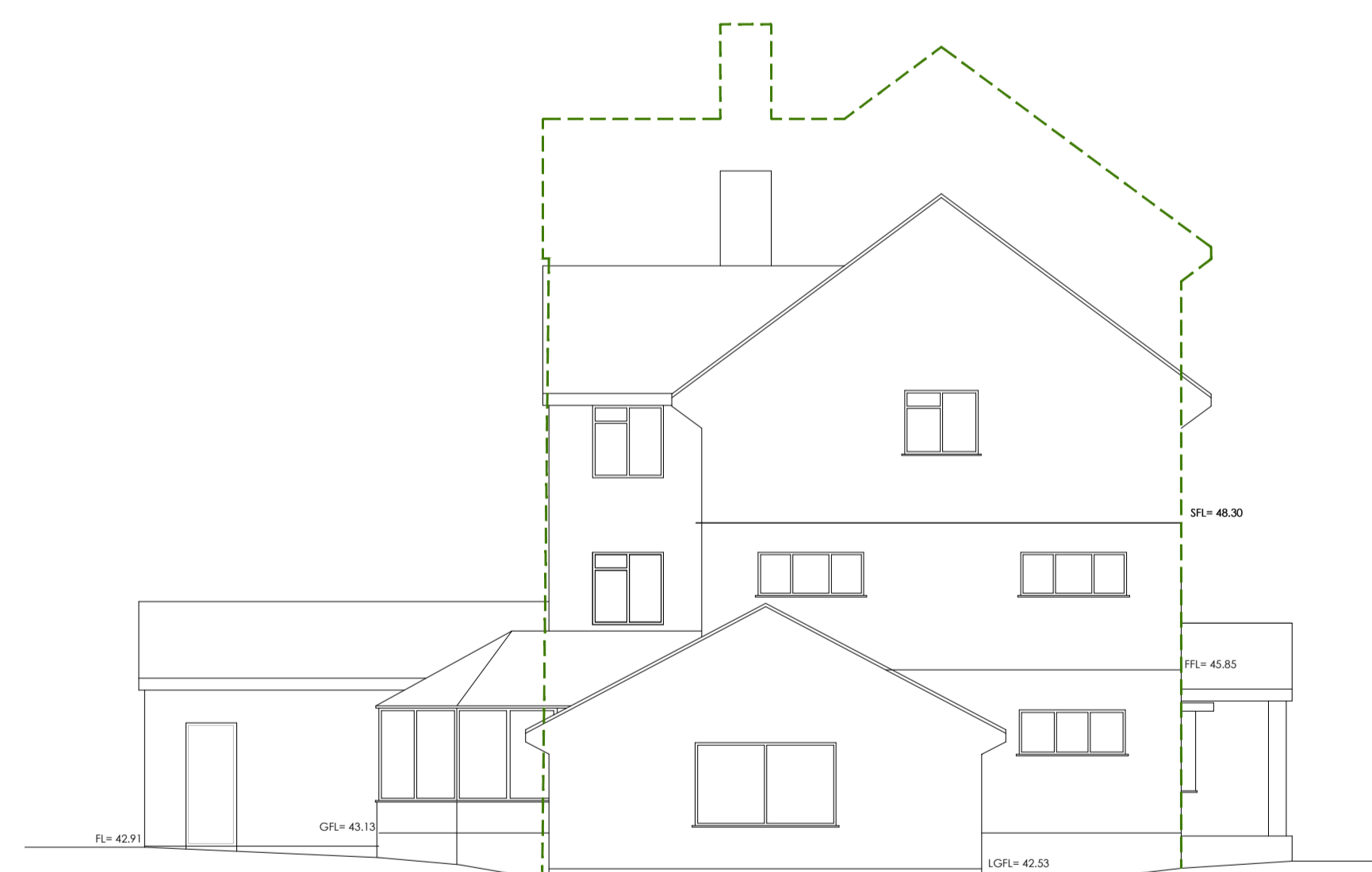
Side Elevation - South / East