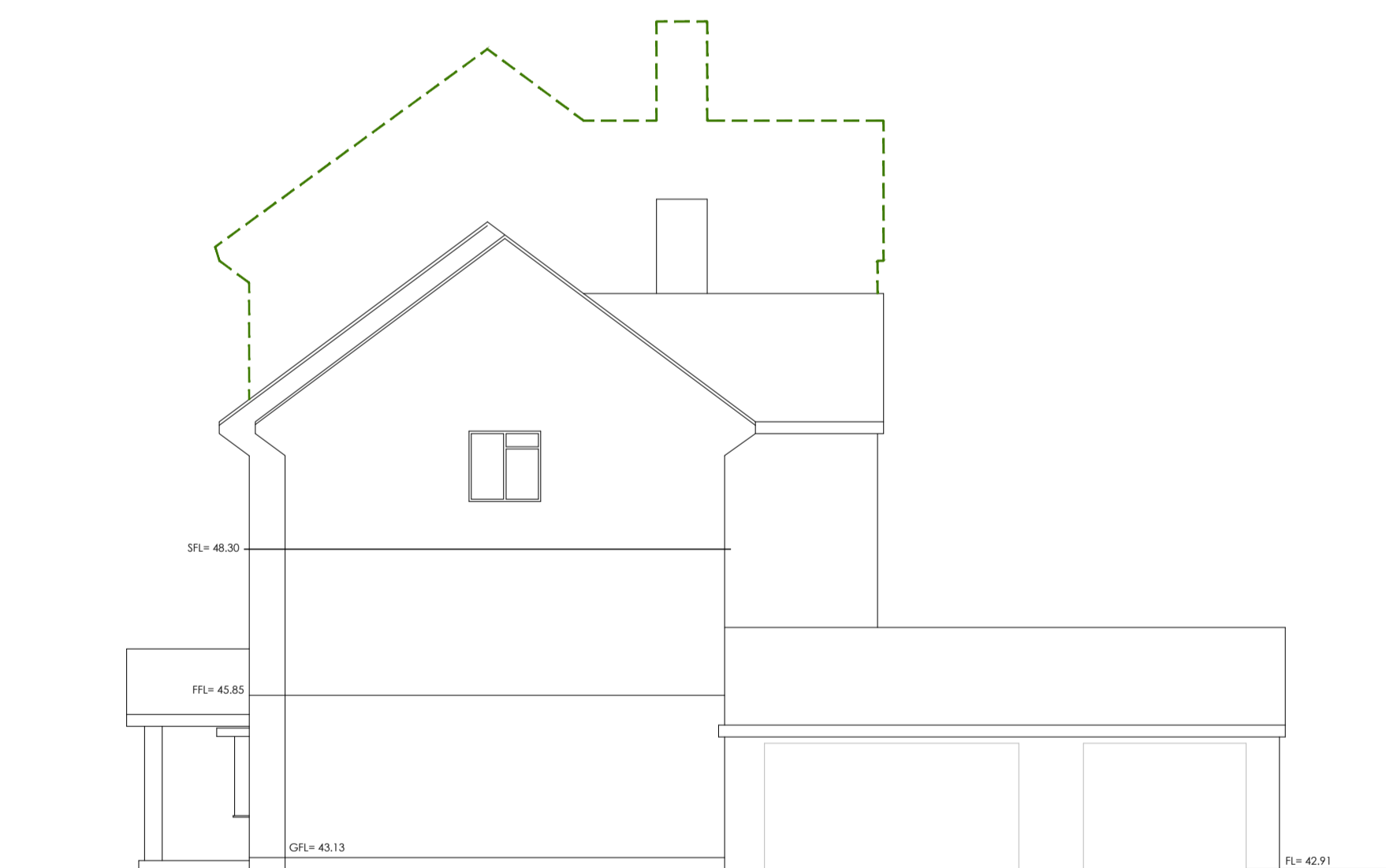
Side Elevation - North / West