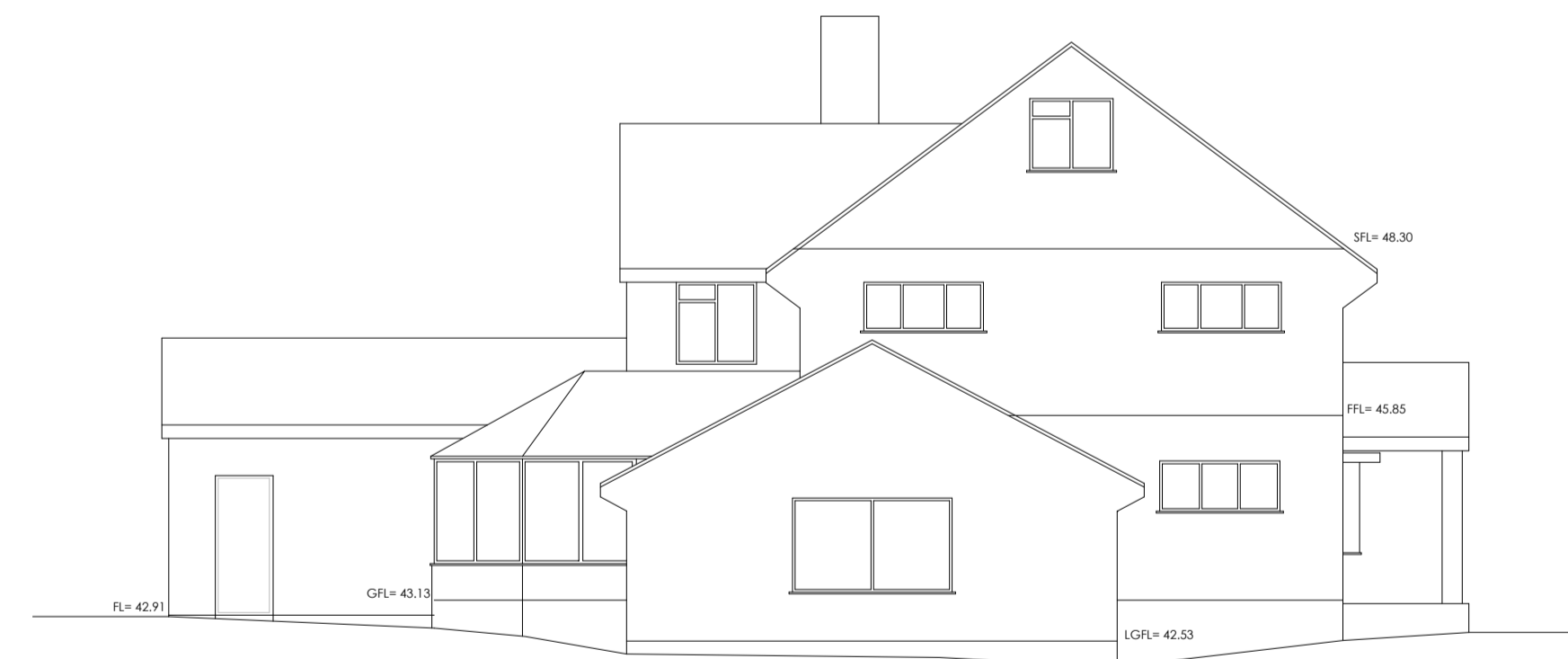
NORTH WEST ELEVATION SCALE 1:100