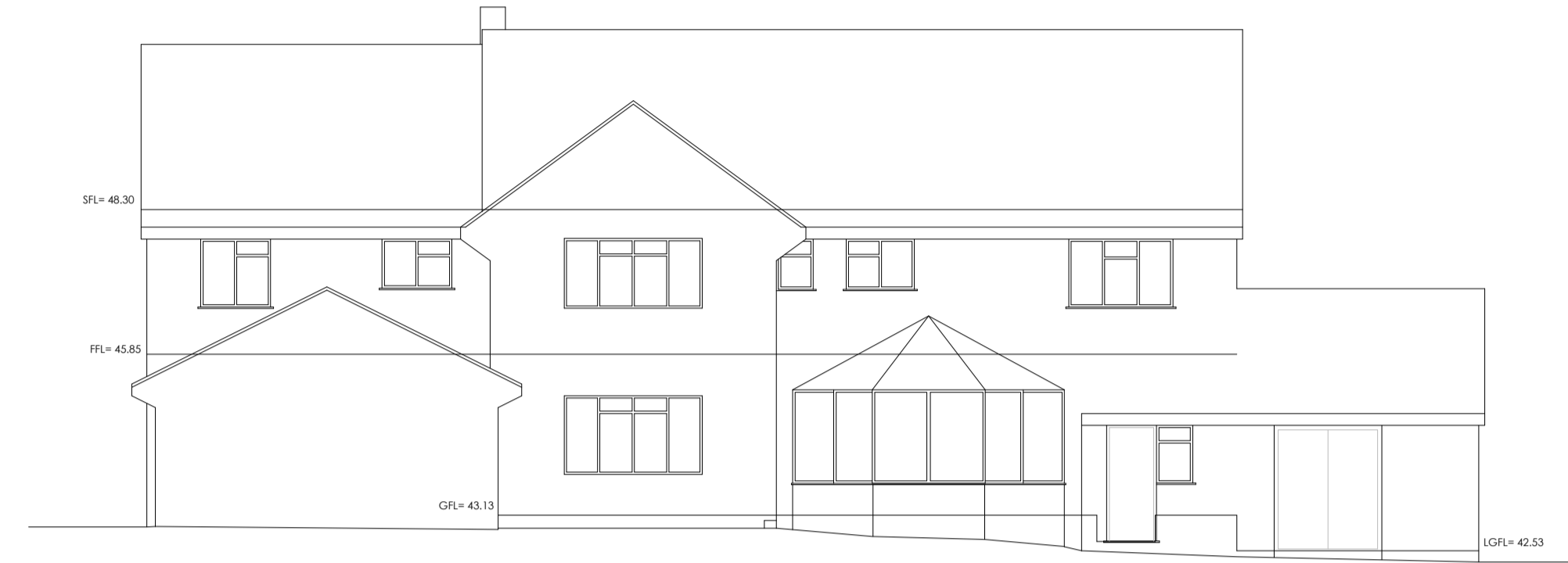
SOUTH WEST ELEVATION SCALE 1:100