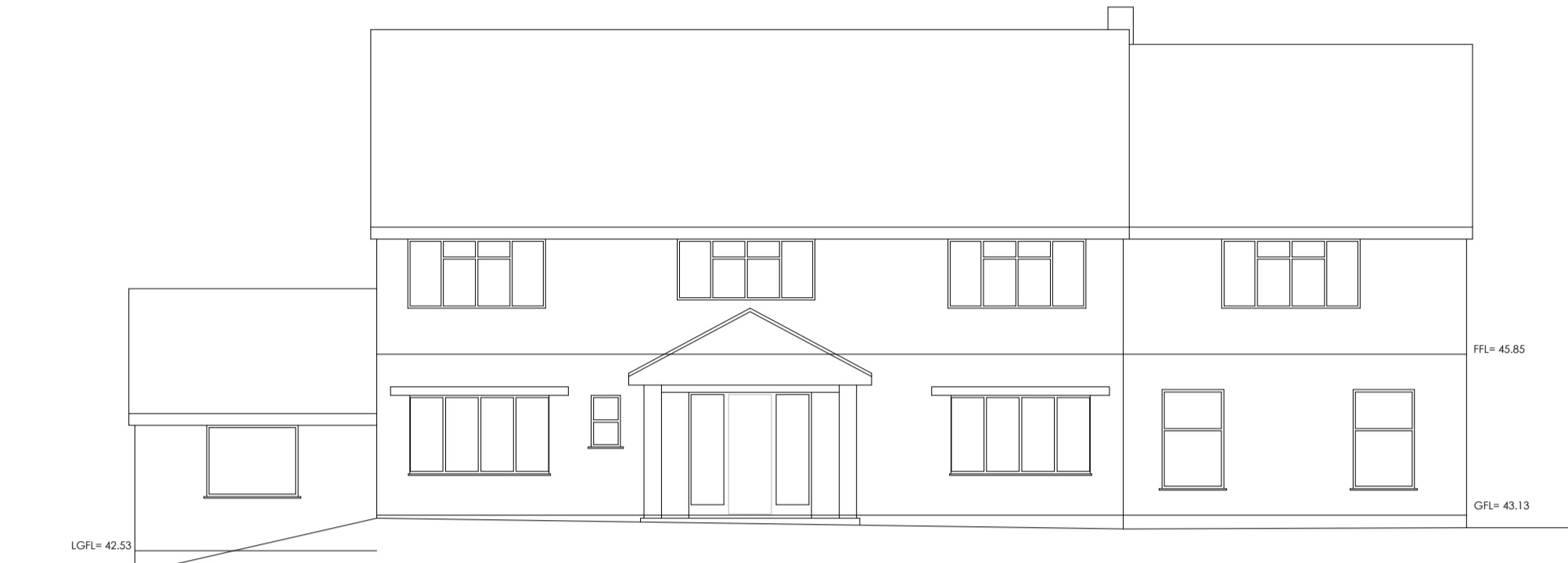
NORTH EAST ELEVATION SCALE 1:100