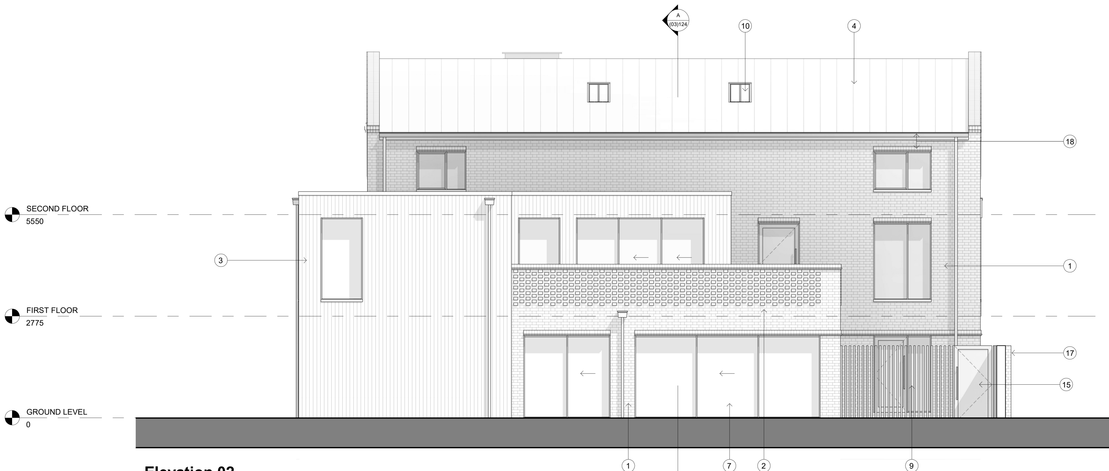
Elevation 02 1 : 50