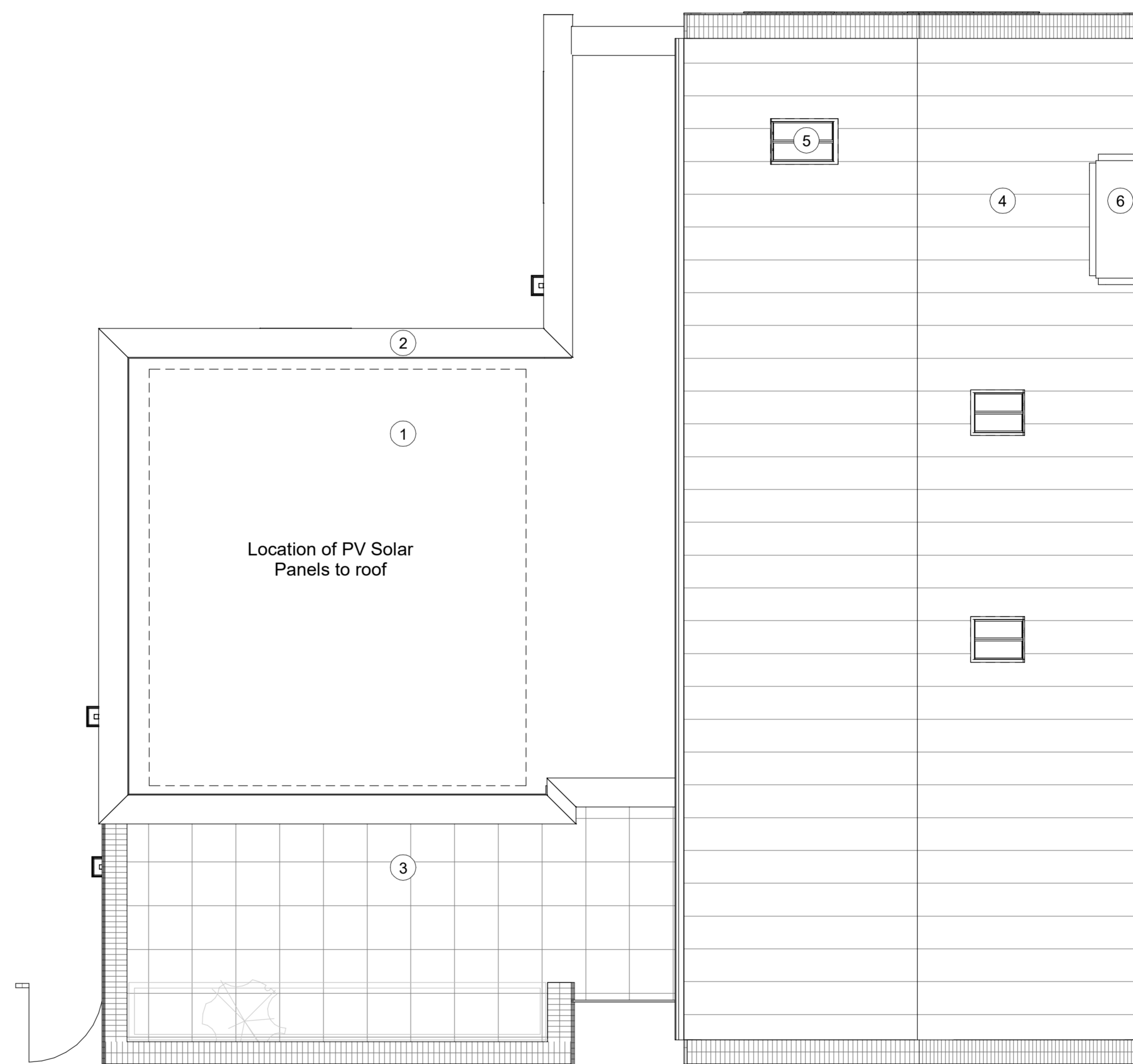
Roof Plan 1 : 50