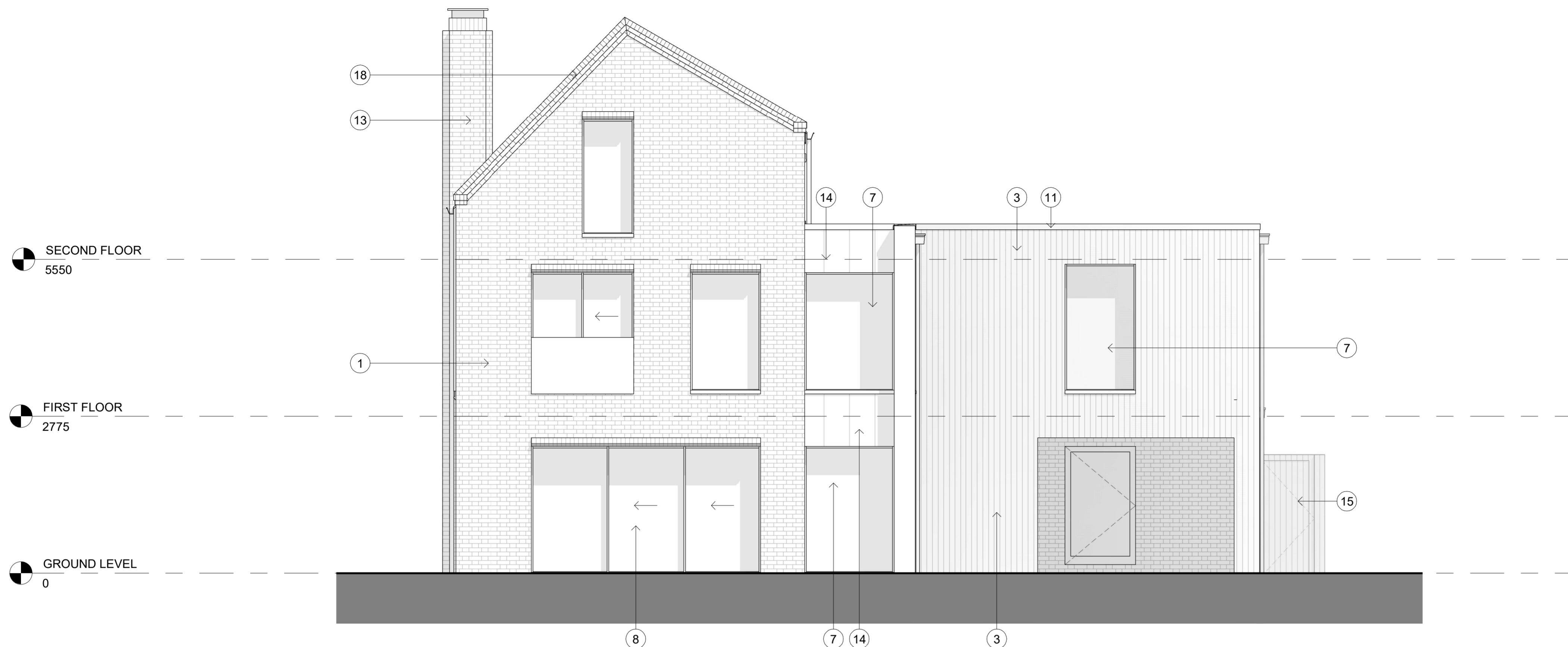
Elevation 03 1 : 50