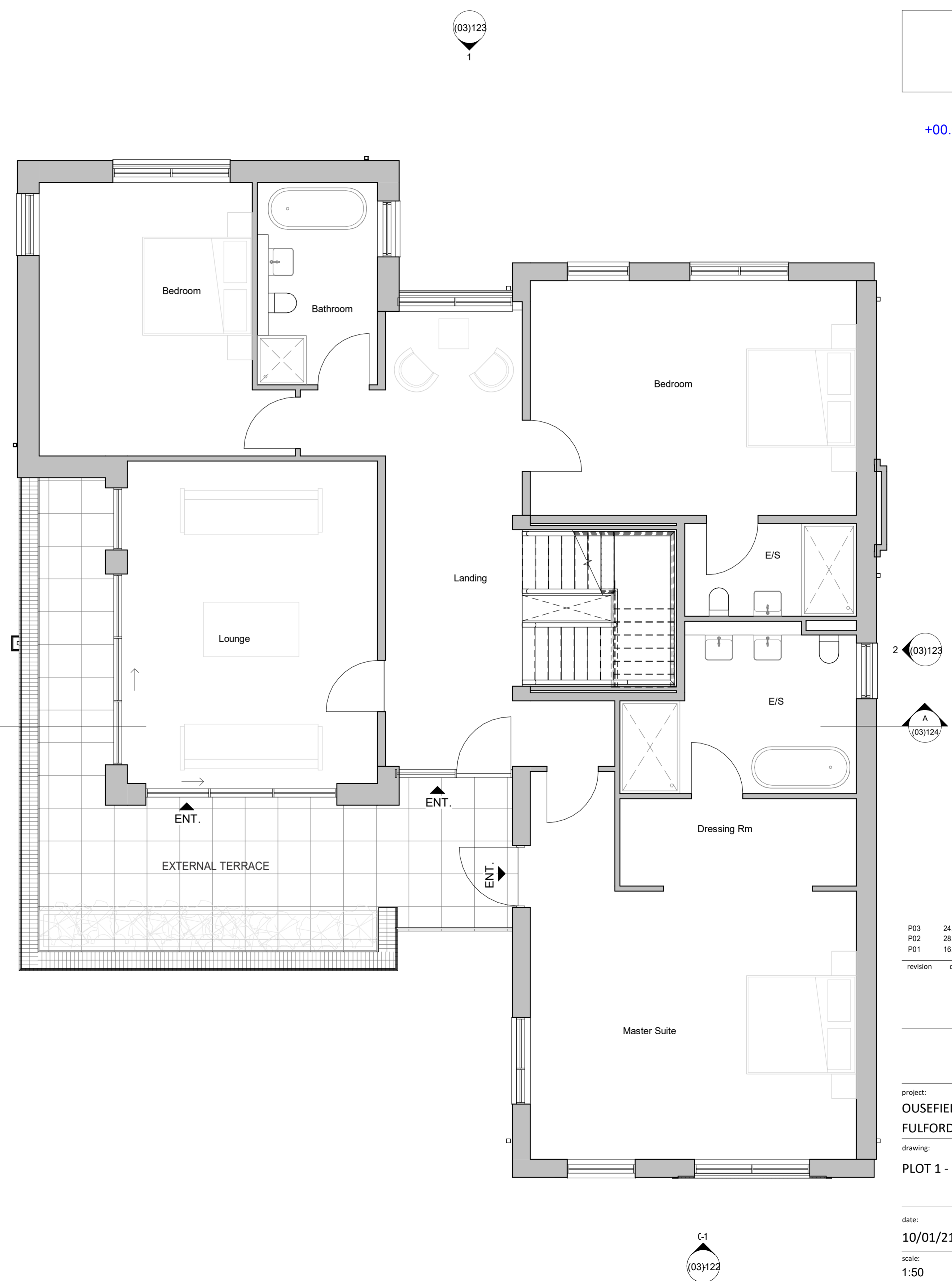
Ground Floor Plan 1 : 50