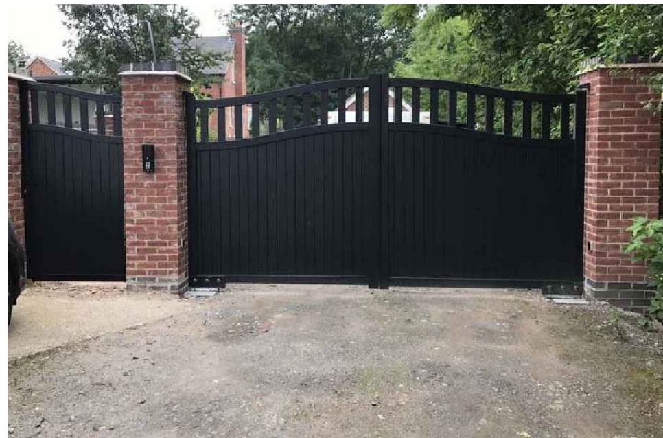
02 PRECEDENT IMAGE 140 N.T.S