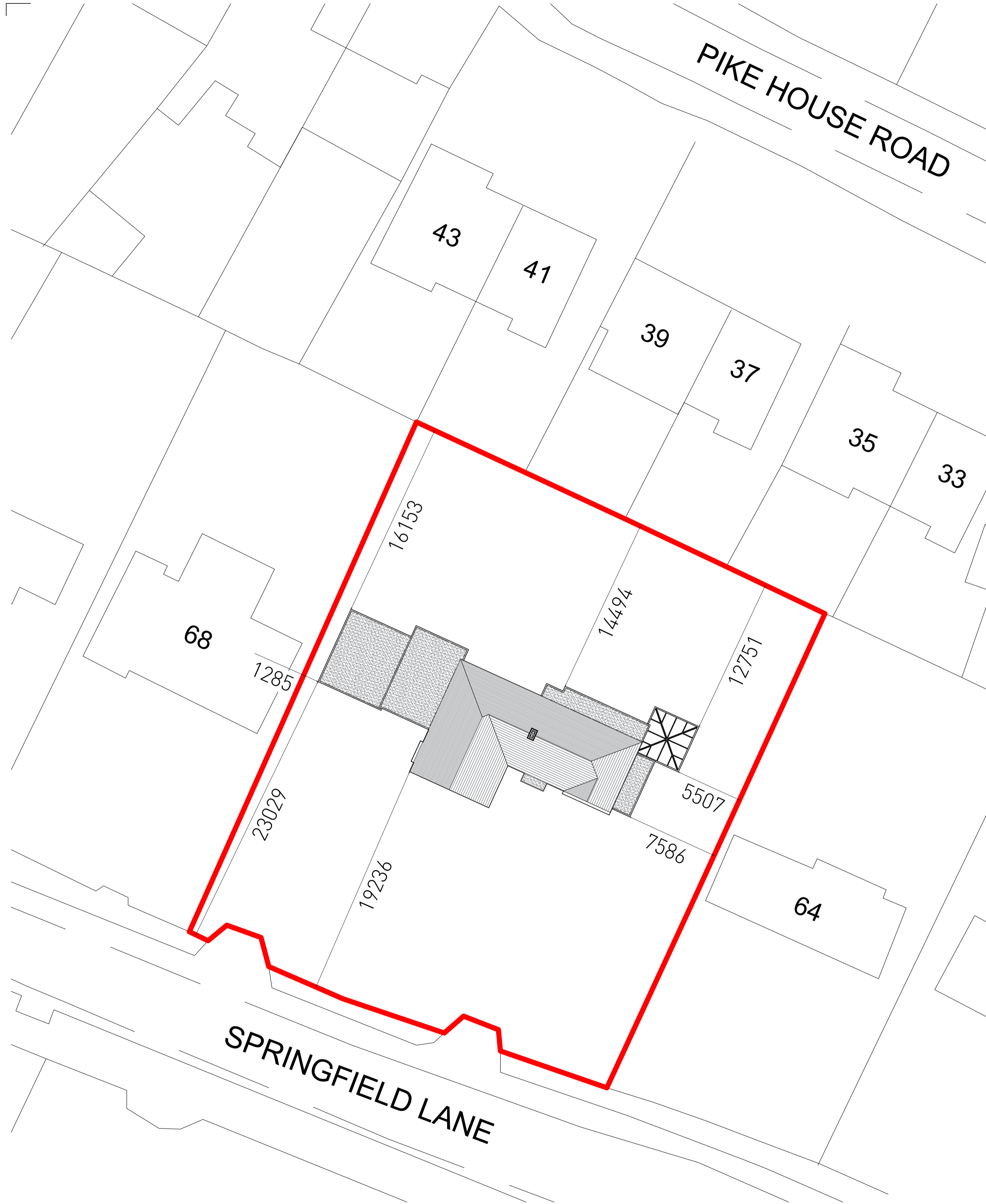
SITE PLAN - AS EXISTING Scale 1:200