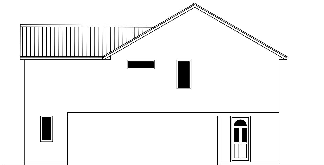
EXISTING ELEVATIONAL SECTION