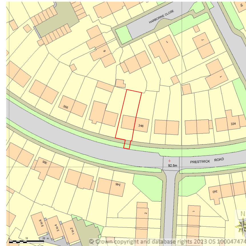
Location Plan@ 1:1250