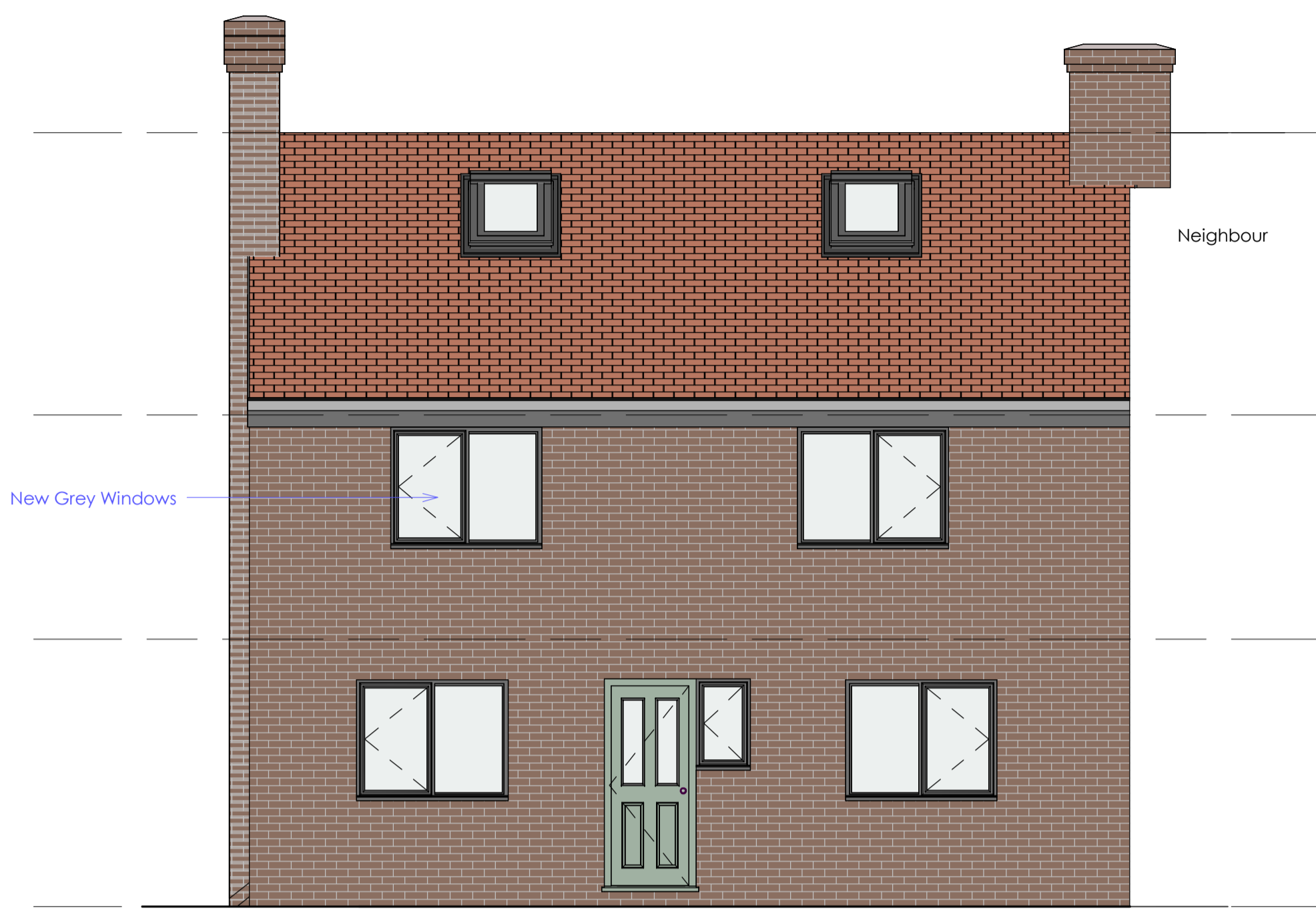
6 Front Elevation 1 : 50