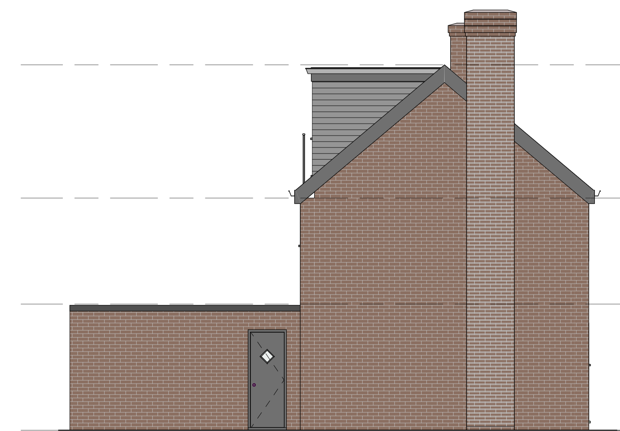
7 Side Elevation 1 : 50