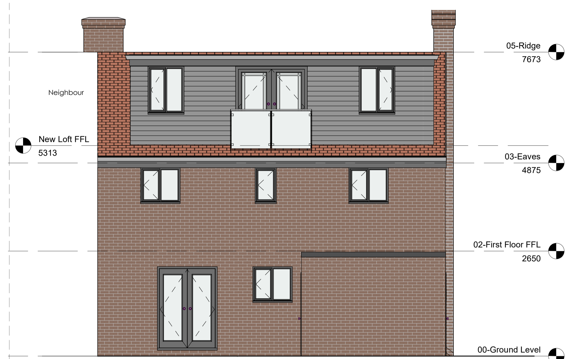
5 Rear Elevation 1 : 50