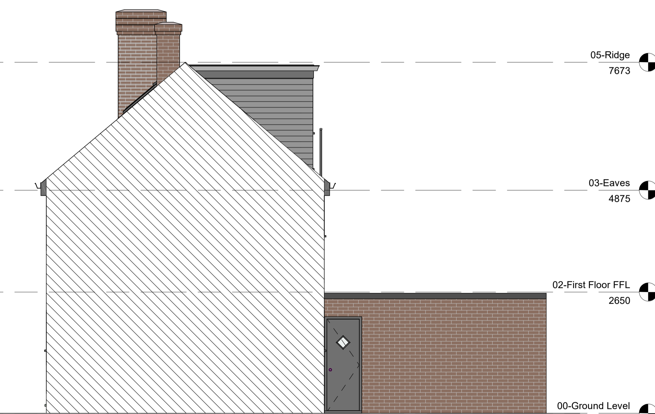
4 Adjoining Elevation 1 : 50