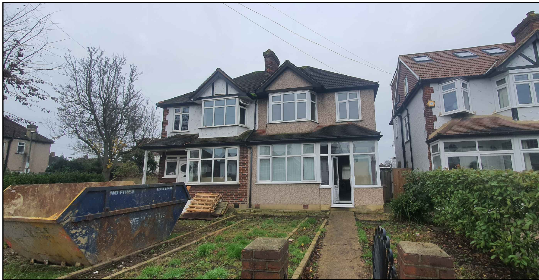
Front elevation (Date: 2023/12/15_11:04:35)