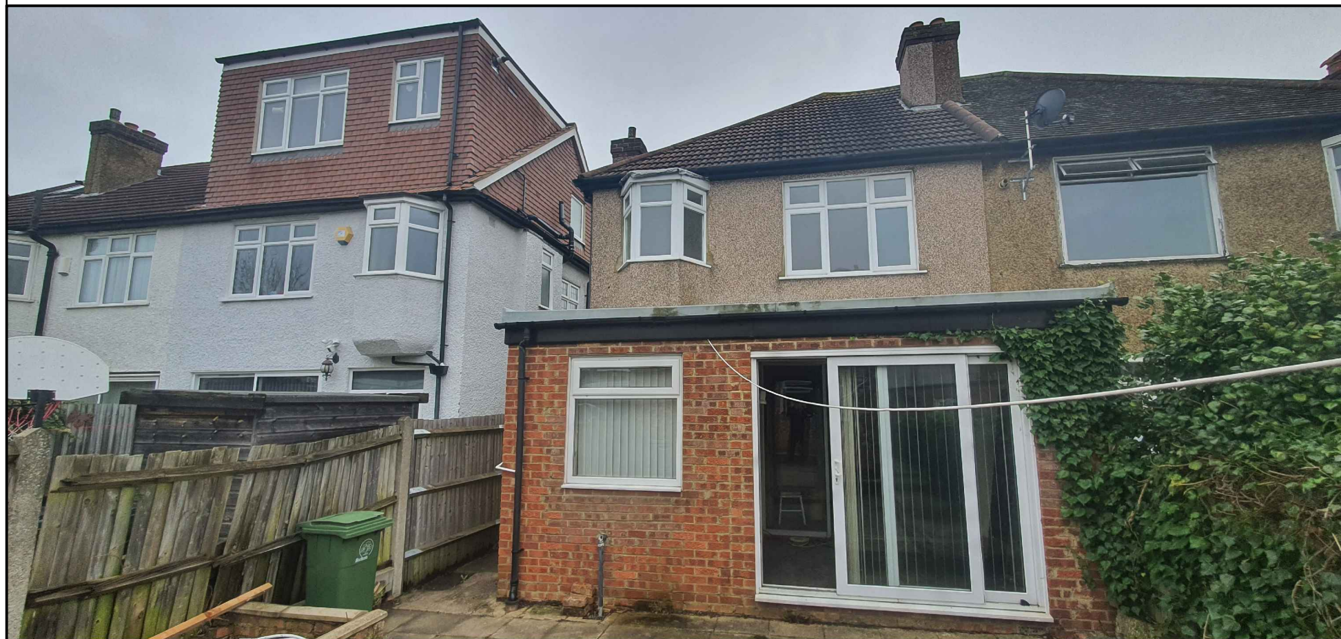
Rear elevation (Date: 2023/12/15_11:04:53)