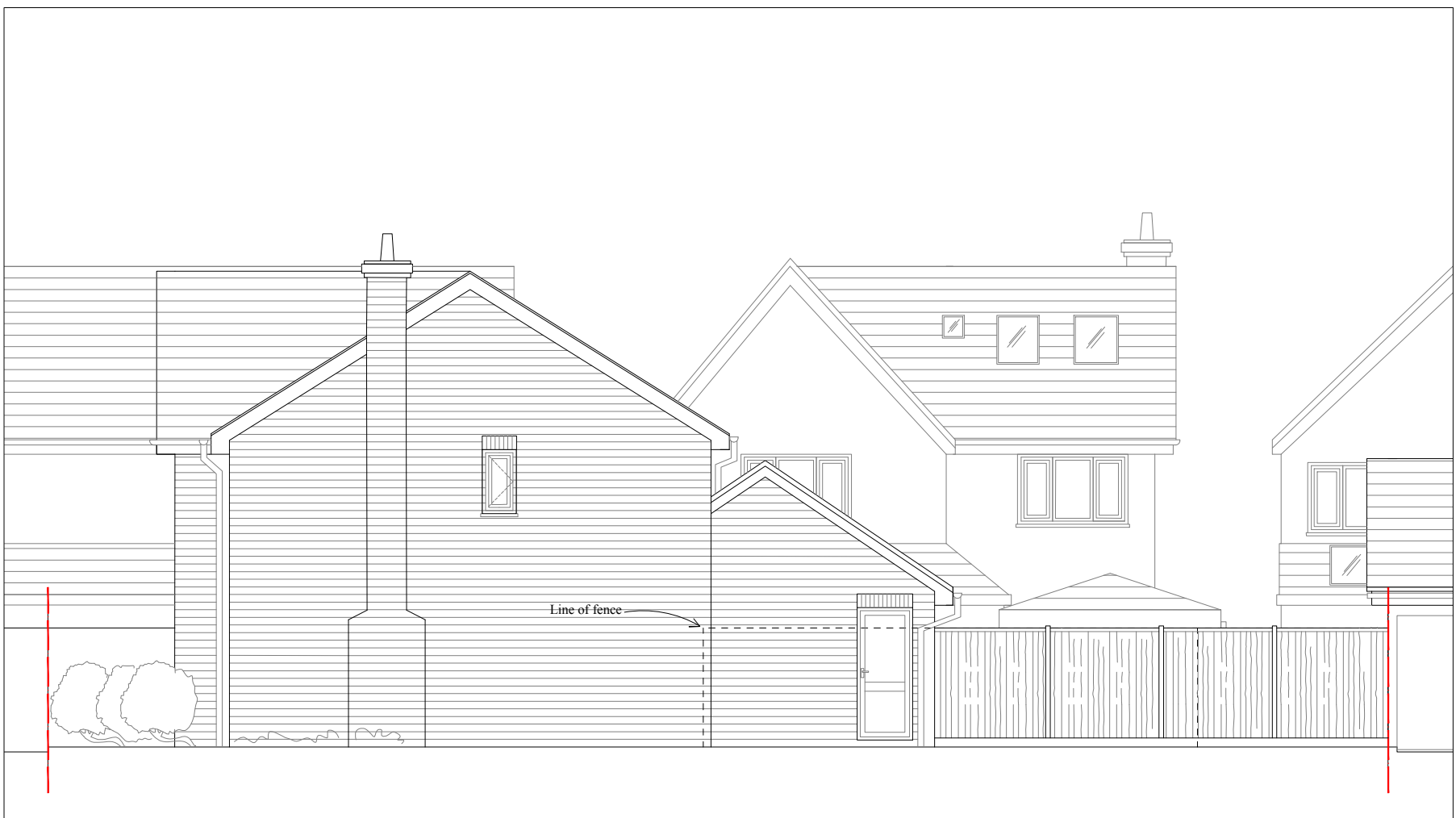
1 NORTH ELEVATION 021 AS EXISTING