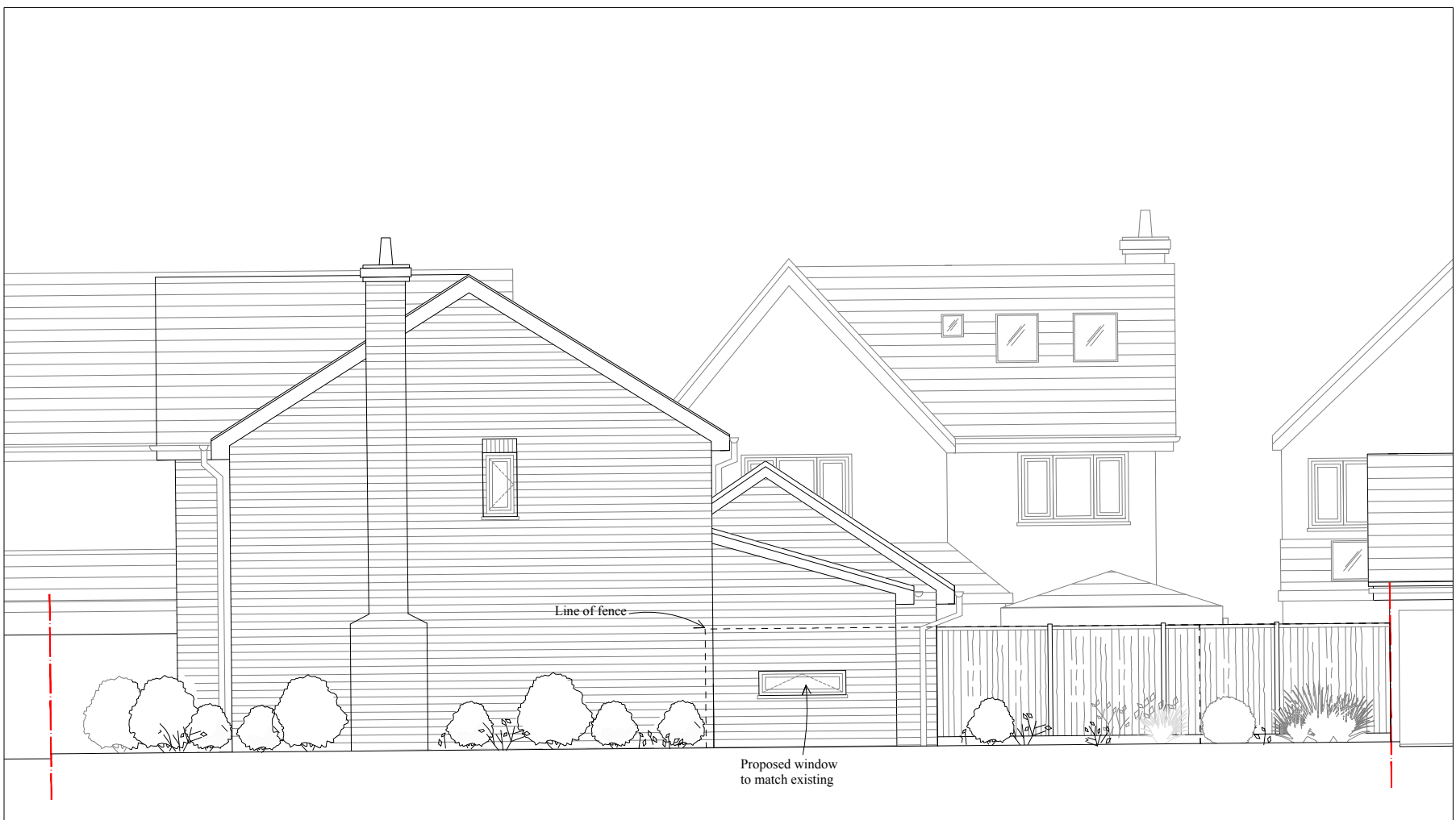
1 NORTH ELEVATION 121 AS PROPOSED