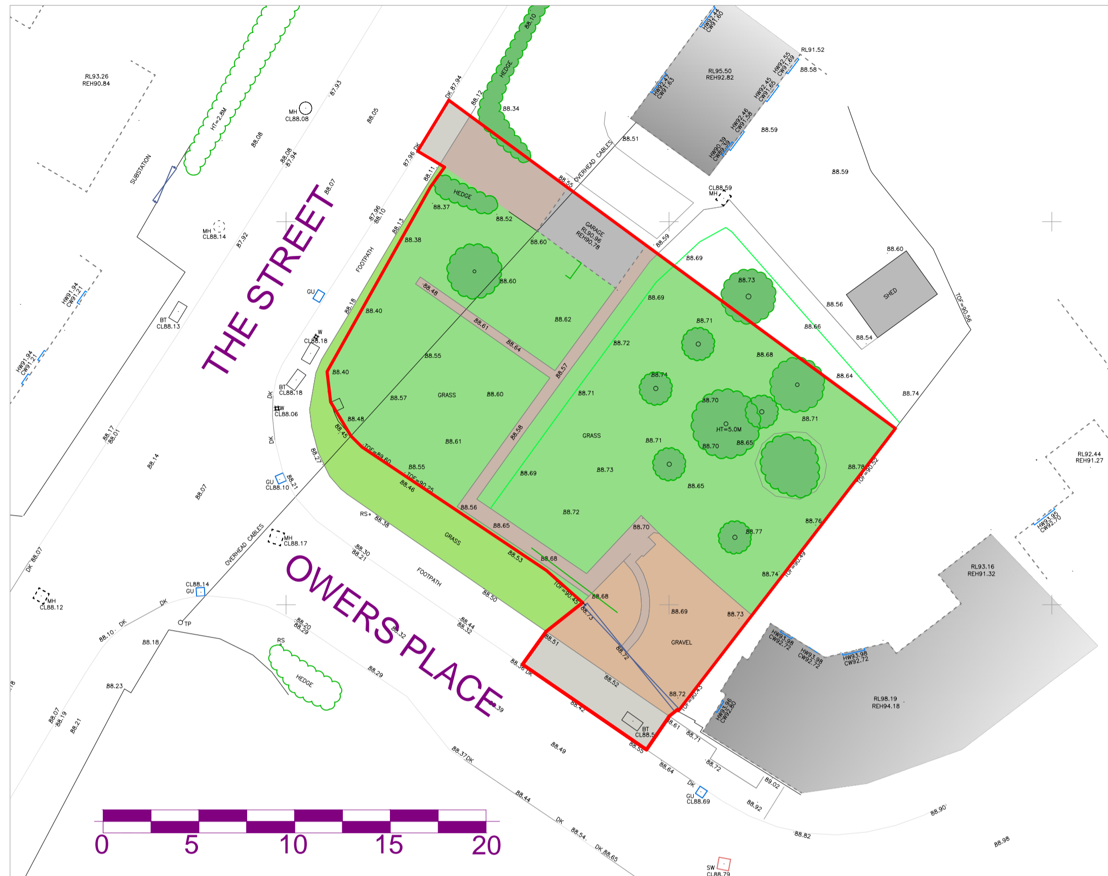
Existing Block Plan - 1:200