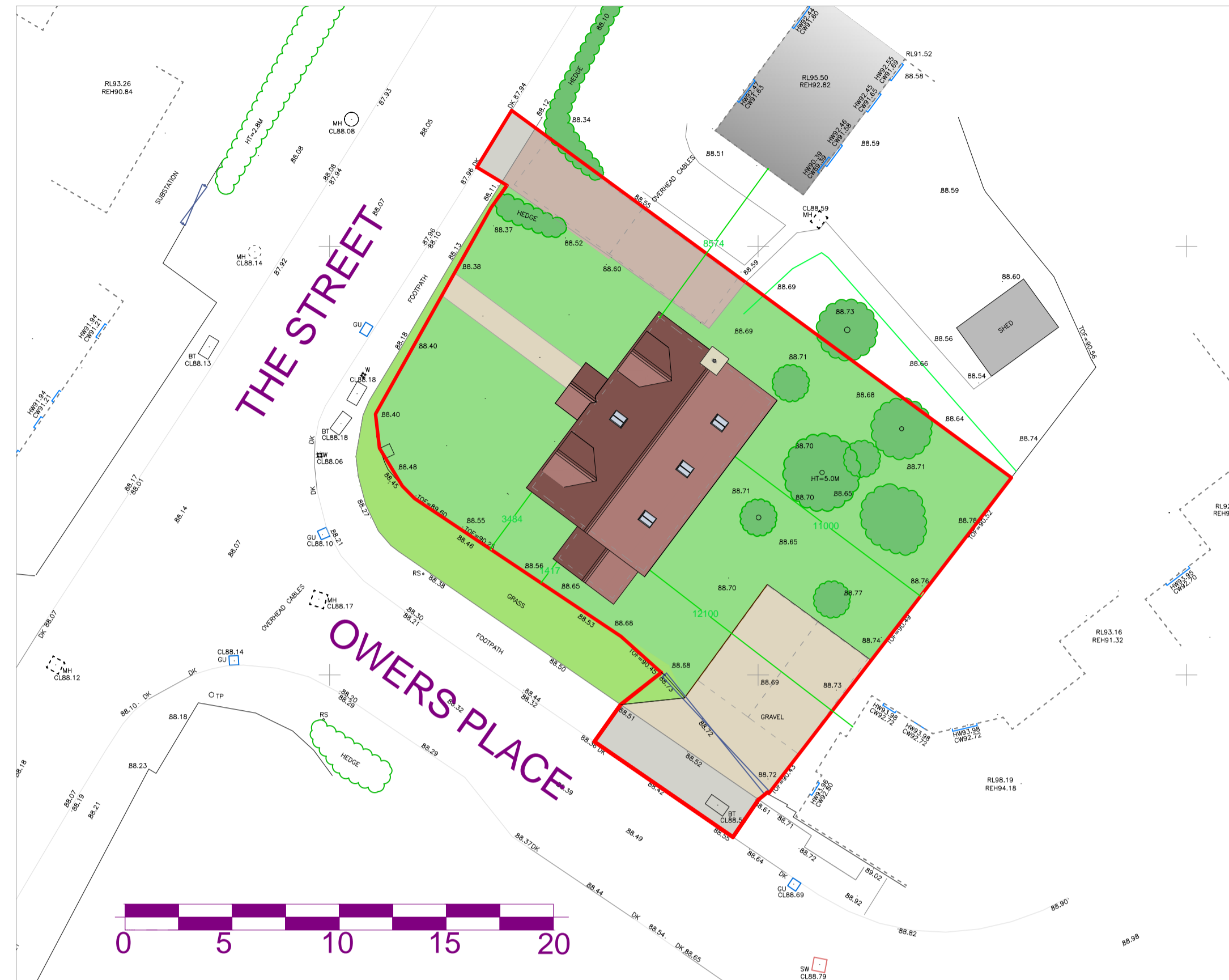
Proposed Block Plan - 1:200