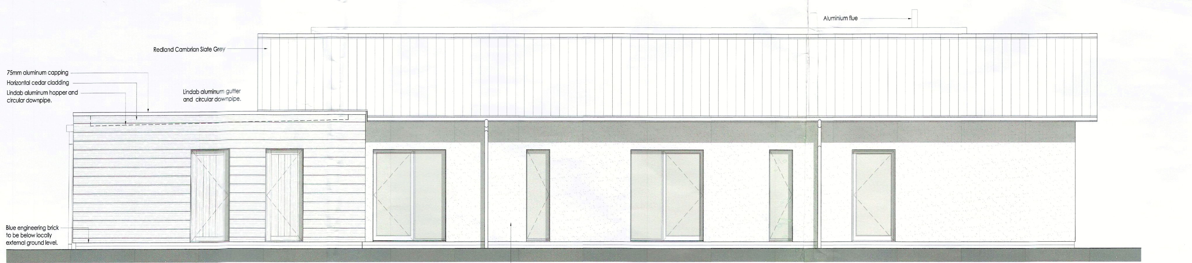
NORTH EAST ELEVATION SCALE 1:50