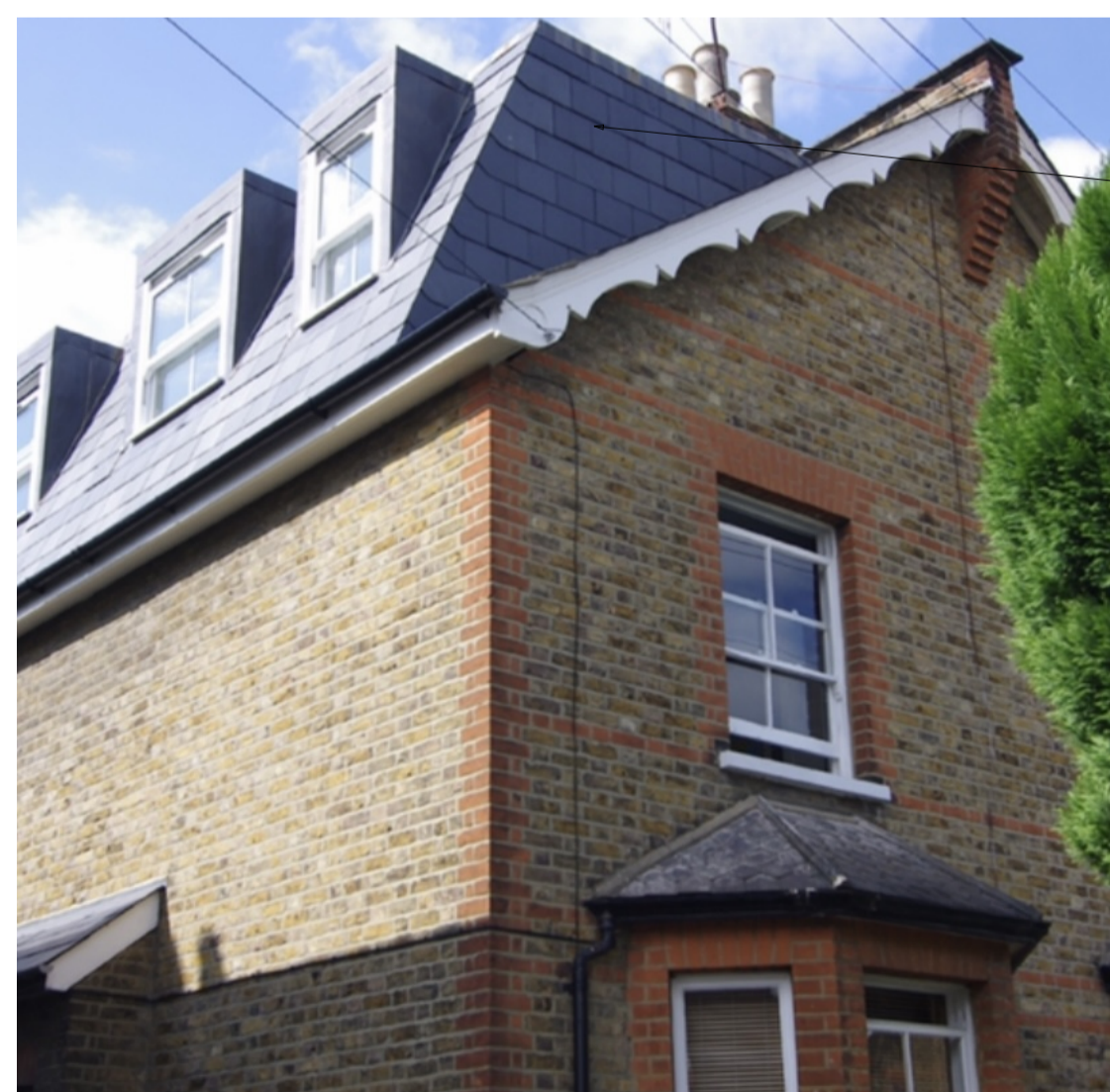
Image of Proposed Mansard Loft Conversion