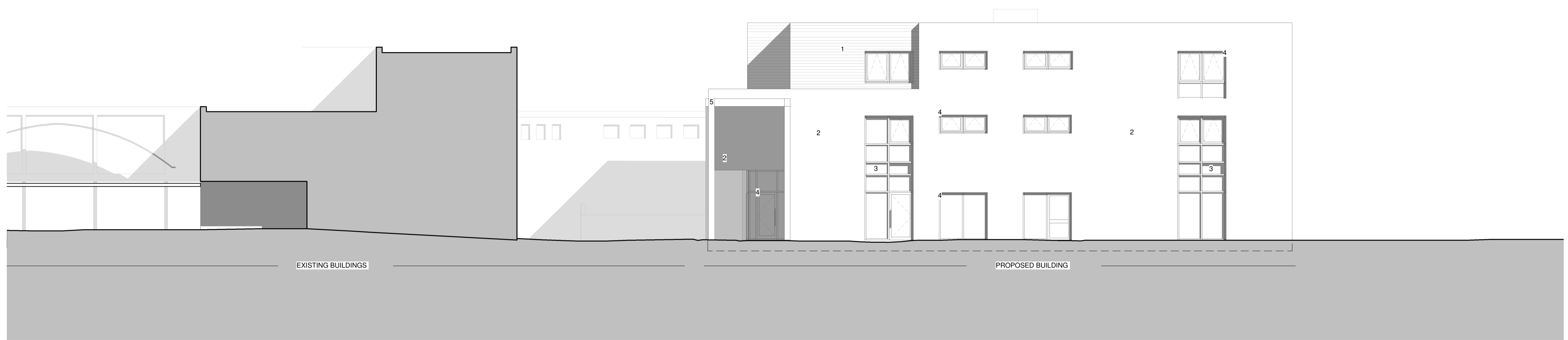
2 North 1 : 100