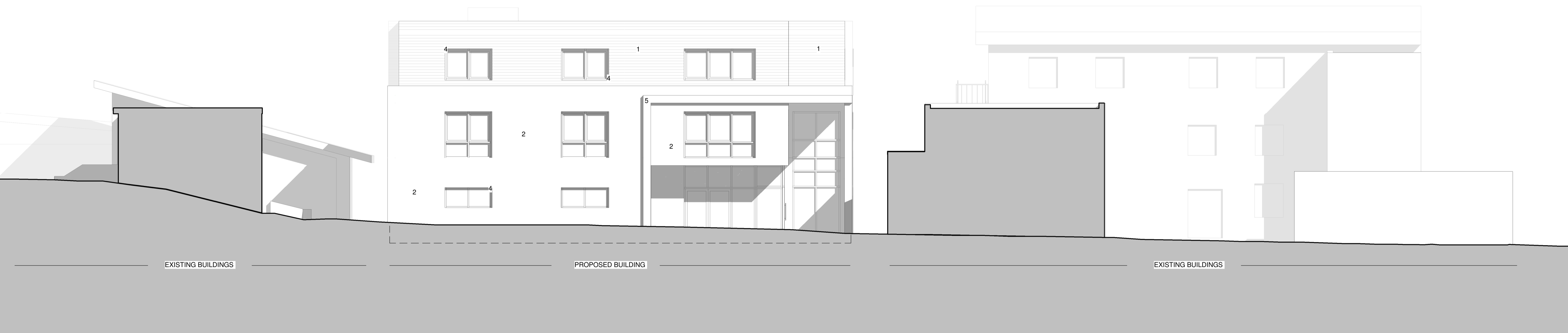
2 East 1 : 100