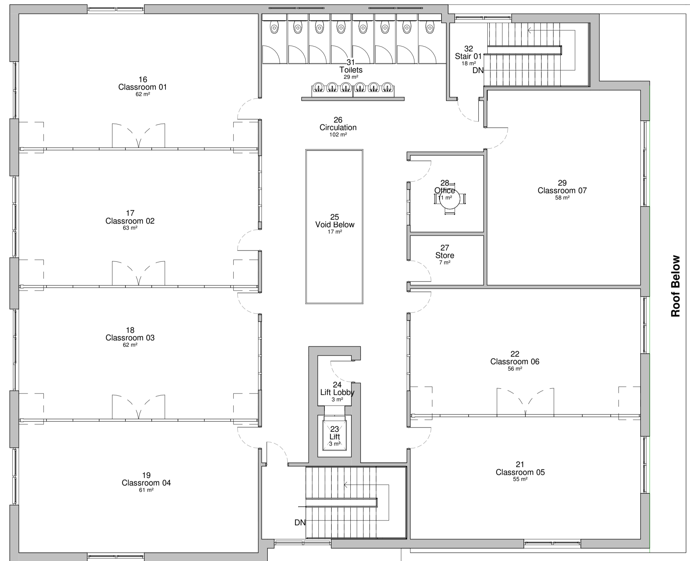
1 Second Floor 1 : 100