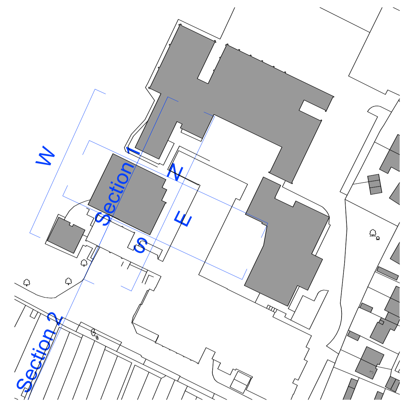
1 Location Plan 1 : 1000