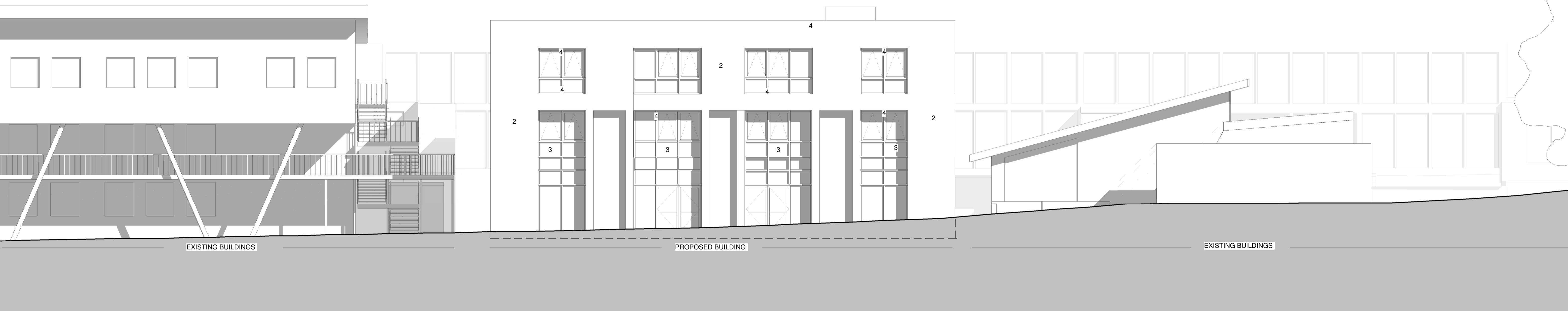
2 West 1 : 100