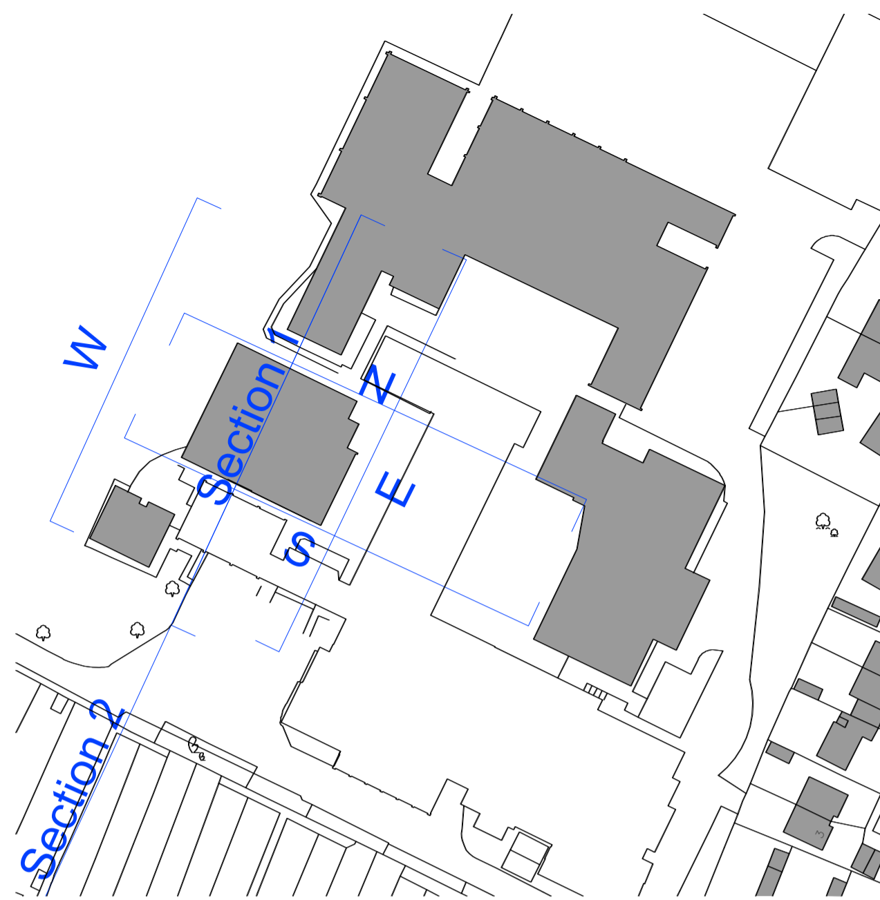
1 Location Plan. 1 : 1000