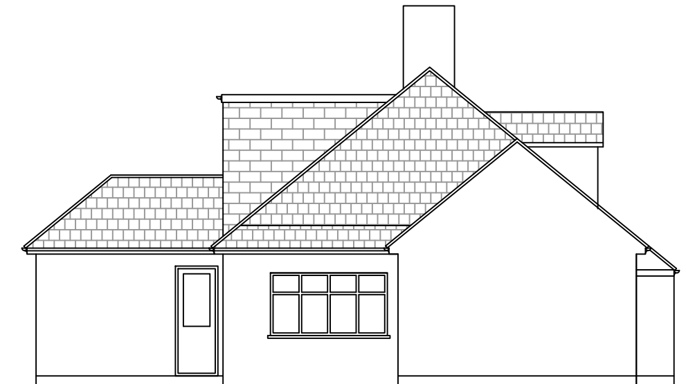
EXISTING LEFT SIDE ELEVATION