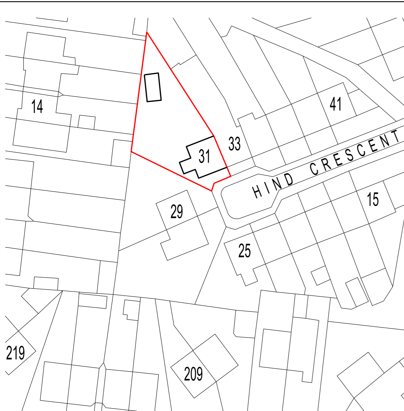
EXISTING BLOCK PLAN scale 1:500