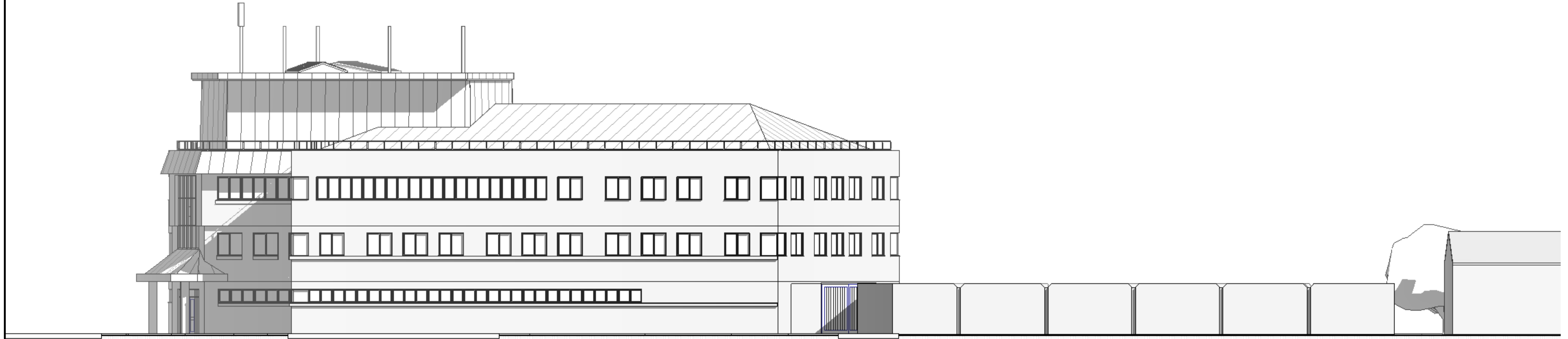
1 Existing South West Elevation 1 : 125