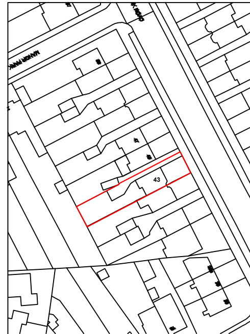
Site Plan Scale: 1/1250