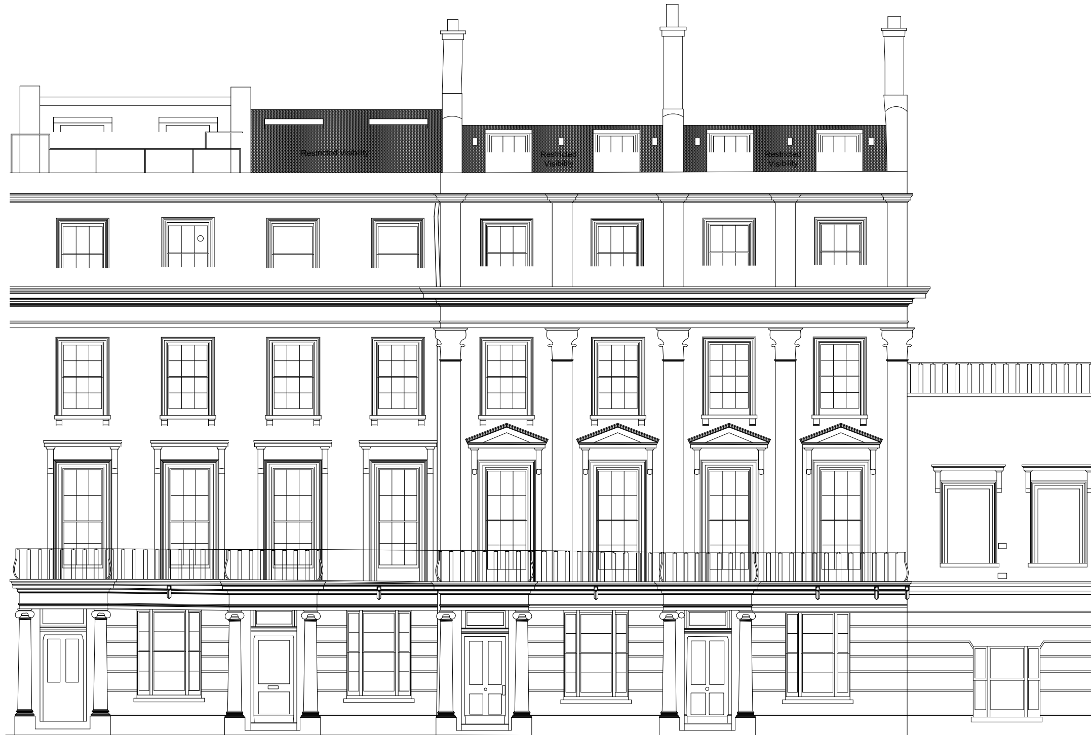
1 Existing Elevation Scale: 1:100