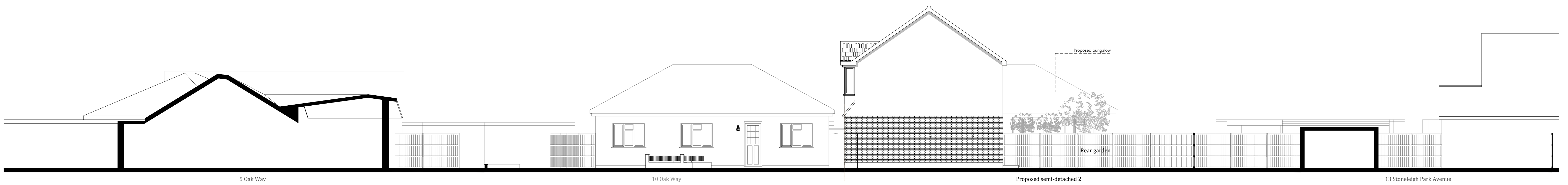
Proposed west elevation in context