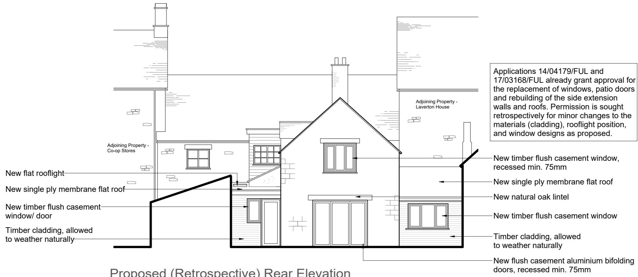
Proposed (Retrospective) Rear Elevation 1 : 100