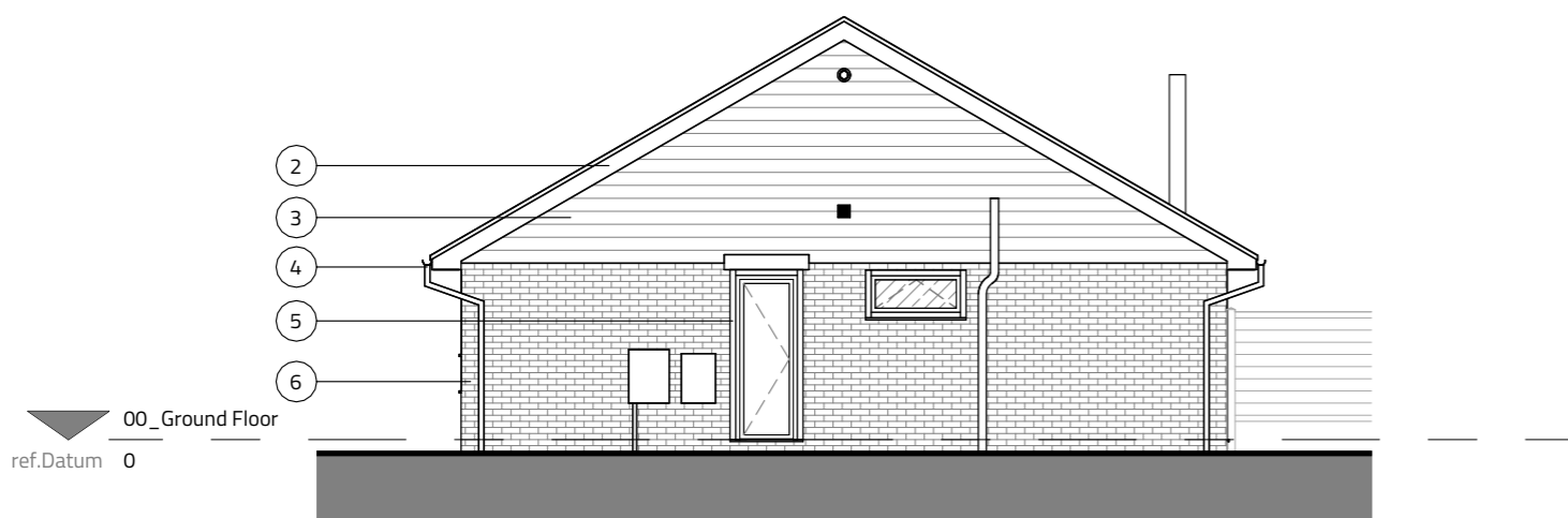
Existing - North 1 : 100