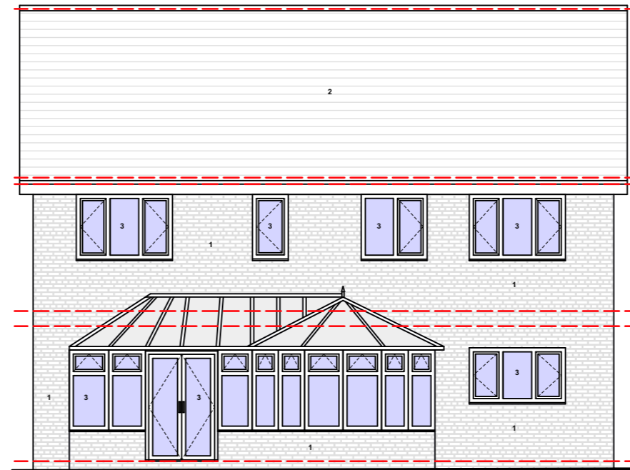
EXISTING GA REAR ELEVATION @1:100