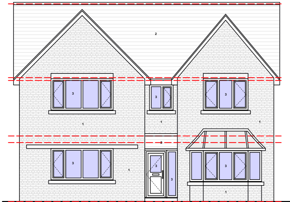
EXISTING GA FRONT ELEVATION @1:100